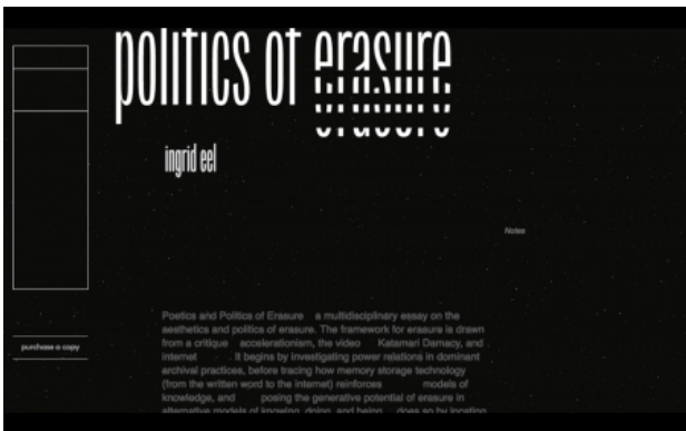
Poetics and Politics of Erasure, 2017 Digital publication