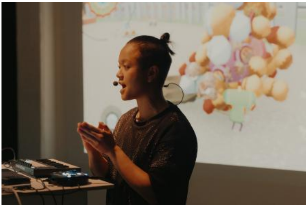
Katamari Damacy: a framework for erasure [reroll], 2021 lecture-performance, video, sound, 15 minutes