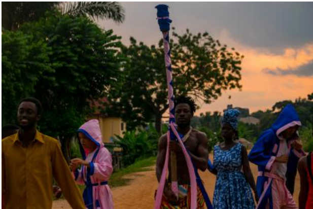
Masked Rituals, 2022 Performance, sound