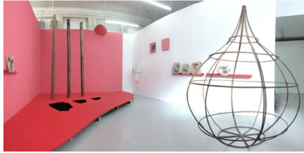
As a pile of ash, 2022