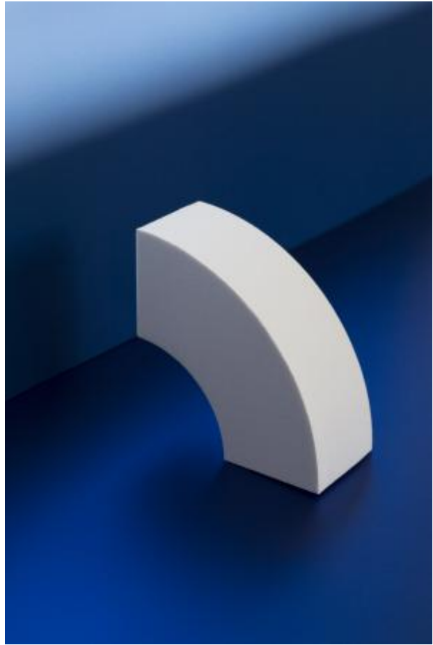
Form from, 2021