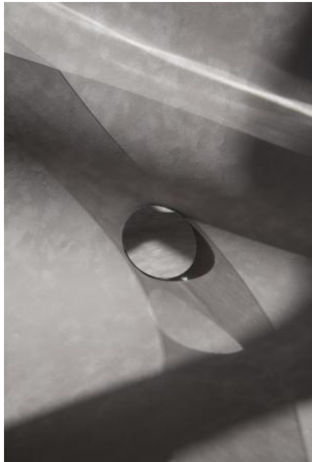
Circle shadow, 2020