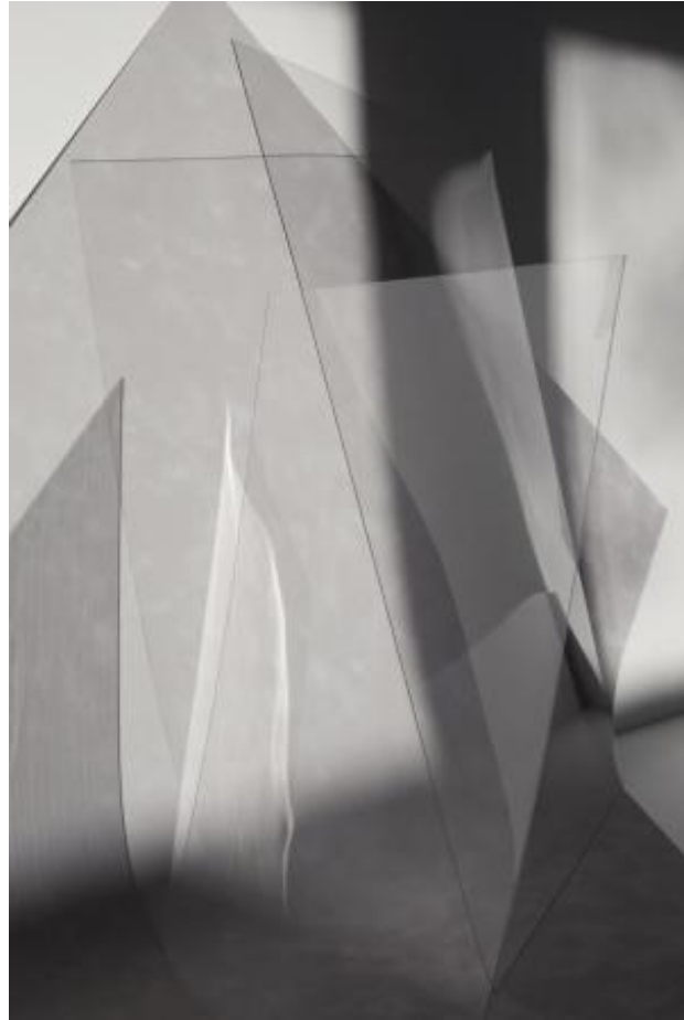
Circle shadow, 2019