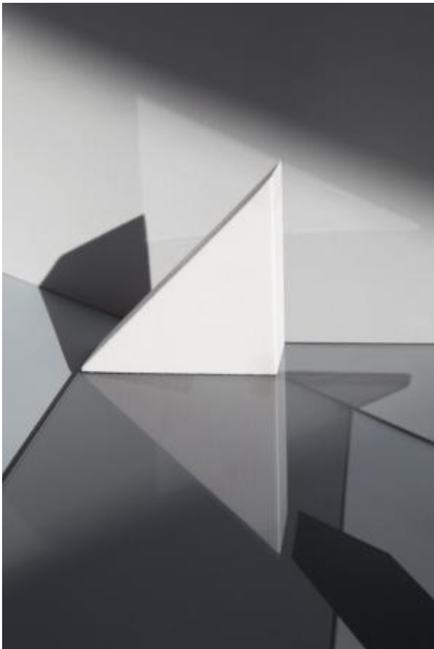
Circle shadow, 2020