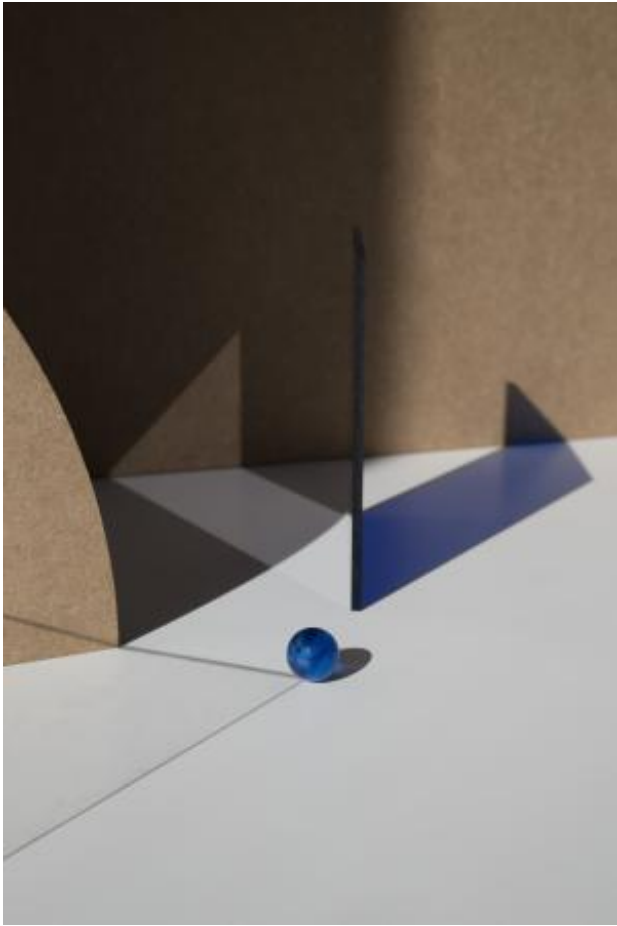
Form from, 2021