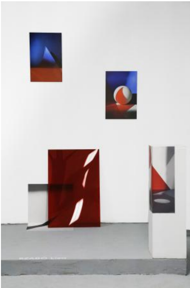
Form from, 2020 Various