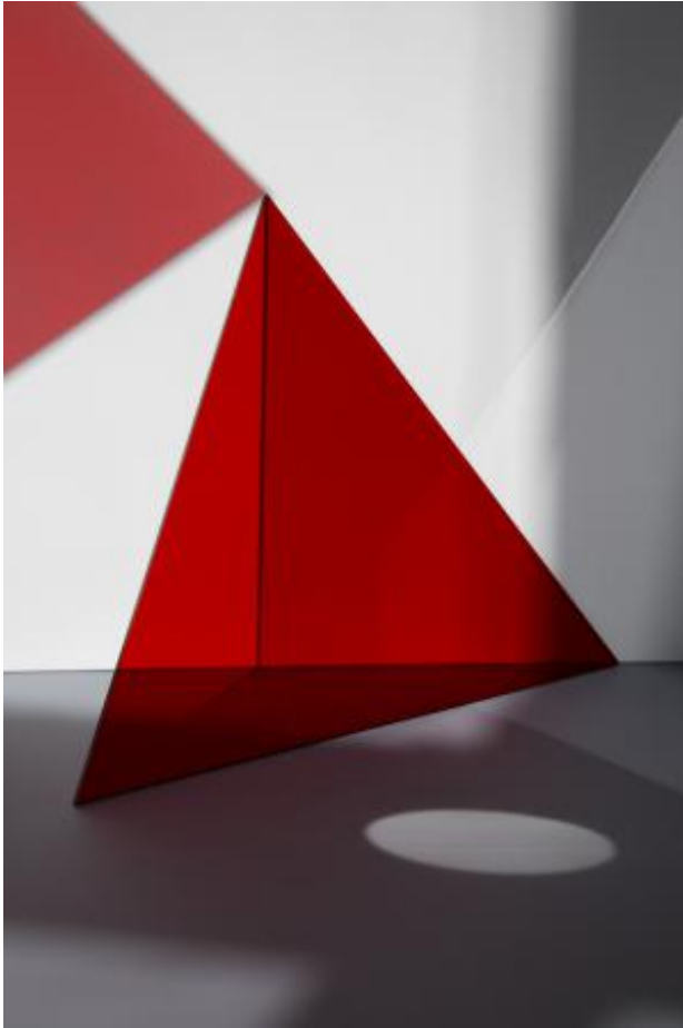
Form from, 2020