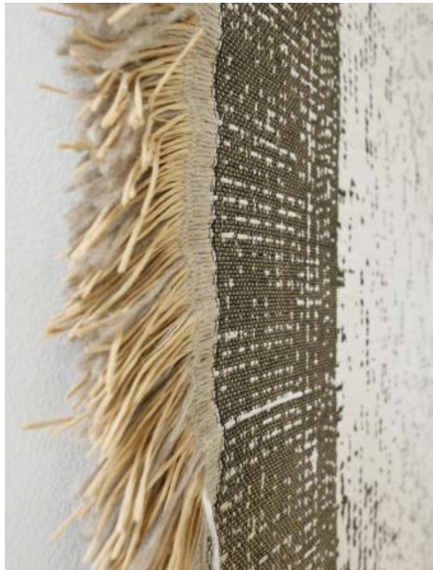
1 cm = 1000 year, 2021 jacquard weaving, 160 x 160 cm