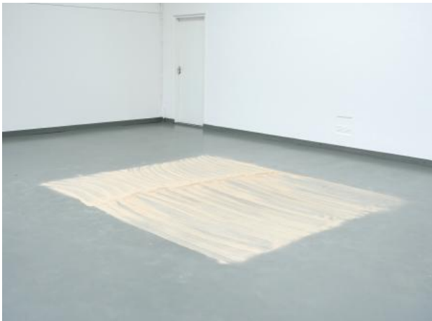
1cm = 1000 year, 2021 variable, variable