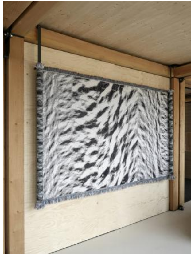
Kadans 2.0, 2022 Jacquard woven, 450 x 140 x 0,5 cm