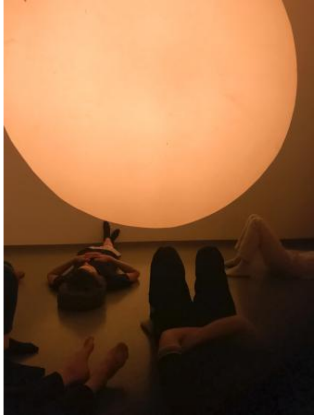
Bathing into Being, 2021 x, x