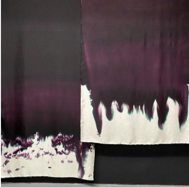
Afterseason, 2022 400 x 145 x 0,2 cm, 400 x 145 x 0,2 cm

2015 - Research assistant, Sandberg Instituut 2017