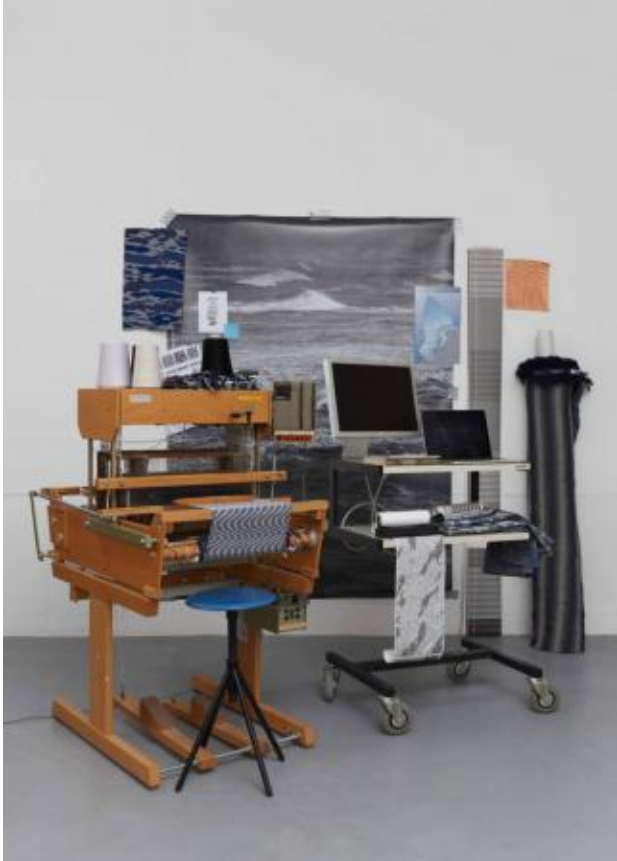
Kadans, 2022 weaving, various