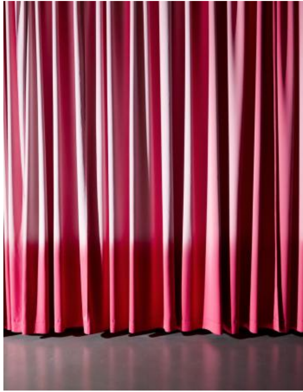
Sún for the Sun, 2021 x, x