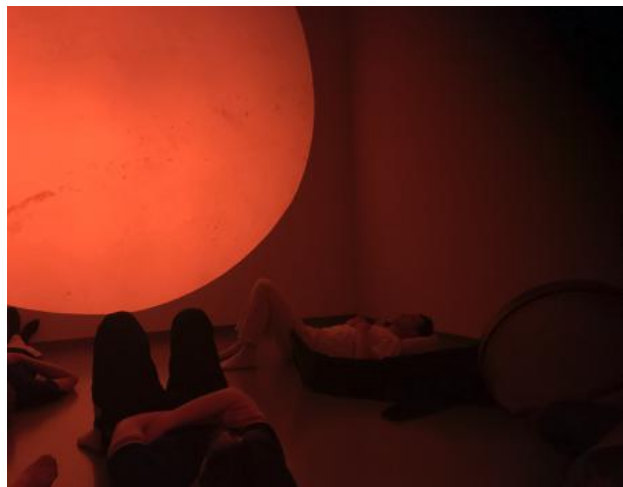
Bathing into Being, 2021 x, x