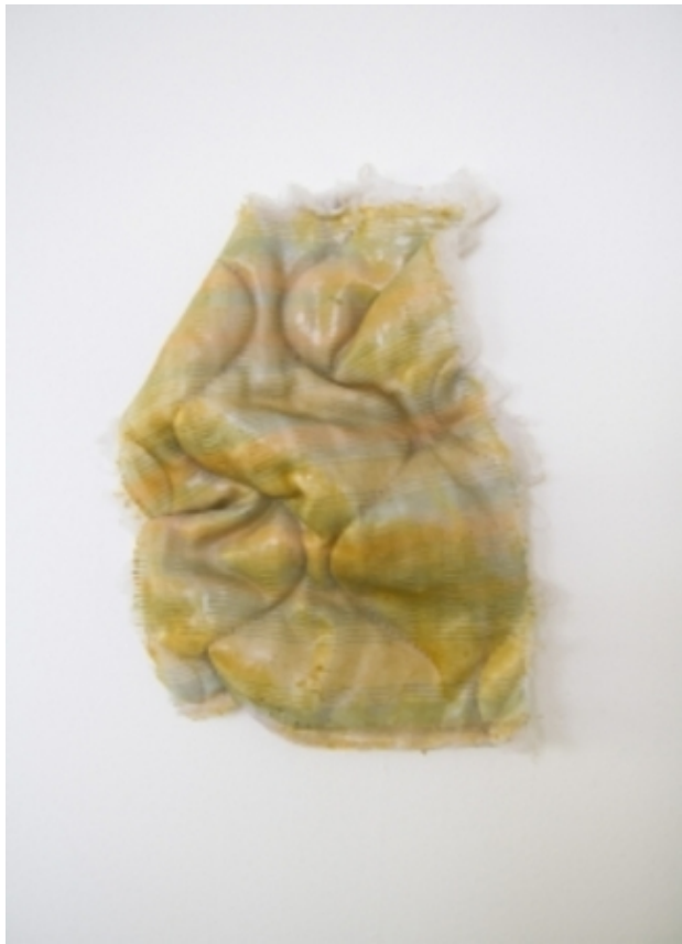
Frontierland (part of installation) latex, embroidery, 20 x 12