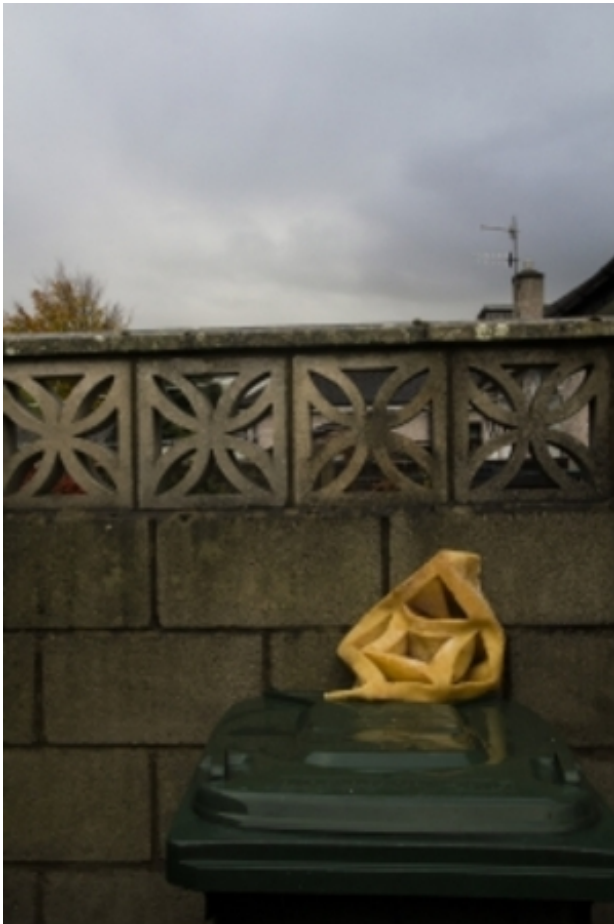
Strickland latex mold, 30 x 30 x 30