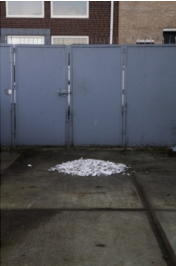
Glory plastic chair- industrially shredded