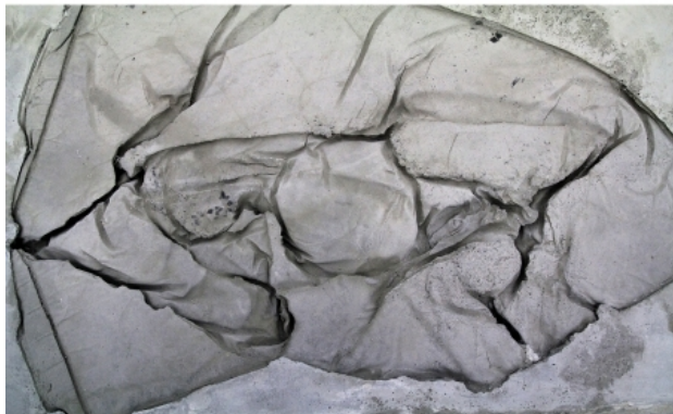
Lay my burden down concrete casting, 350 x 175 x 40