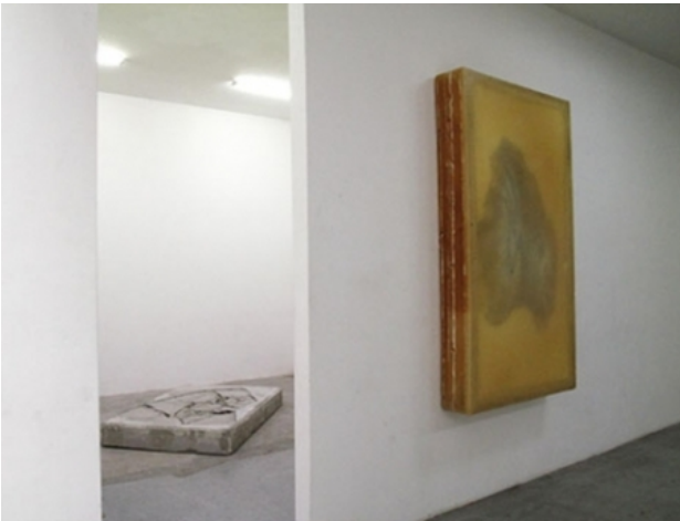
Lay my burden down soap cast, concrete cast, 350 x 175 x 40