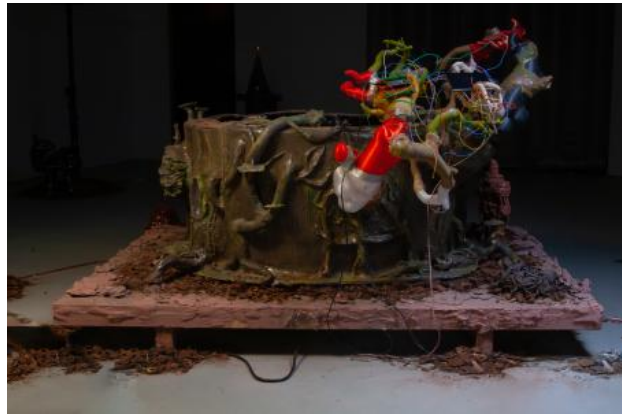
Mimmirsbrunner, 2022 keramiek, 3d print, hout, servo motors, raspberry pi, airbrush, arduino, wires, 160 x 160 x 80