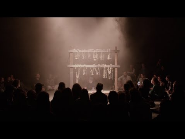
Birth-Elements-One-World, 2024 15:25