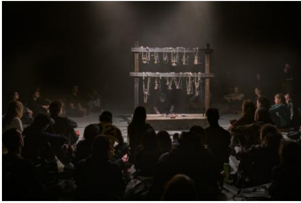
Birth-Elements-One-World, 2024 Wood, bronze, solenoids, electronics, max msp, FDM print, rope, 20 × 200 × 80 cm