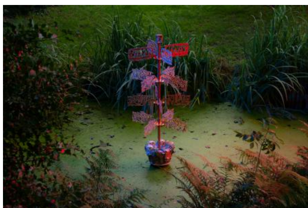
Money Tree, 2021 Koper, keramiek, glazuur, 70 x 70 x 200 cm