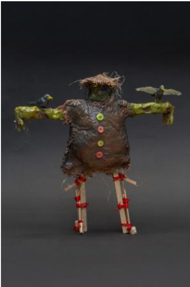
Scarecrow, 2023 wood 3D print, epoxy clay, jute, straw plaster, rope knots, paint, 33 x 38 x 8 cm