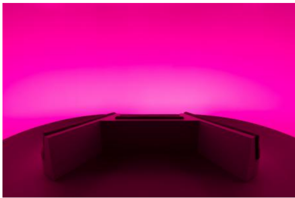
Chasing The Dot, 2024