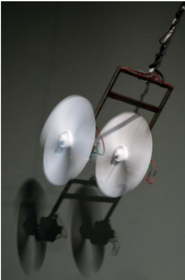
Flying, 2024 Motors, elastics, speakers, cables, amplifier, metal