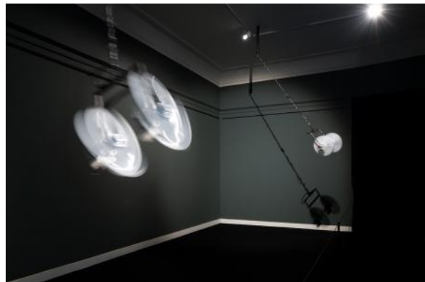
Flying, 2024 Motors, elastics, speakers, cables, amplifier, metal