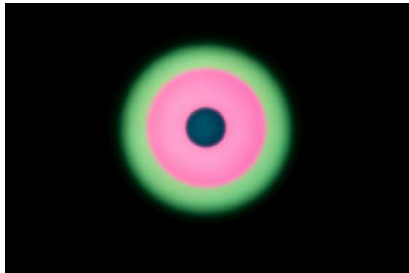
You Are Here, 2024