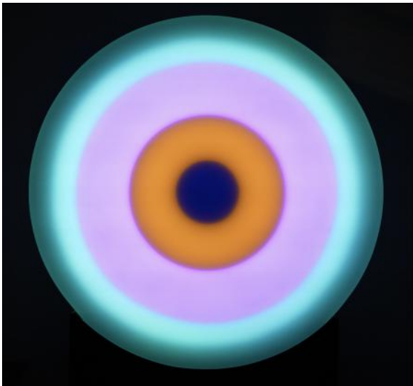
Here You Are, 2024