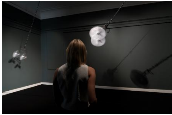
Flying, 2024 Motors, elastics, speakers, cables, amplifier, metal