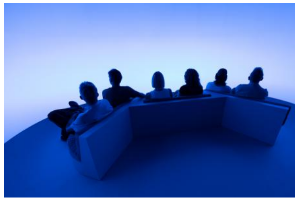
Chasing The Dot, 2024