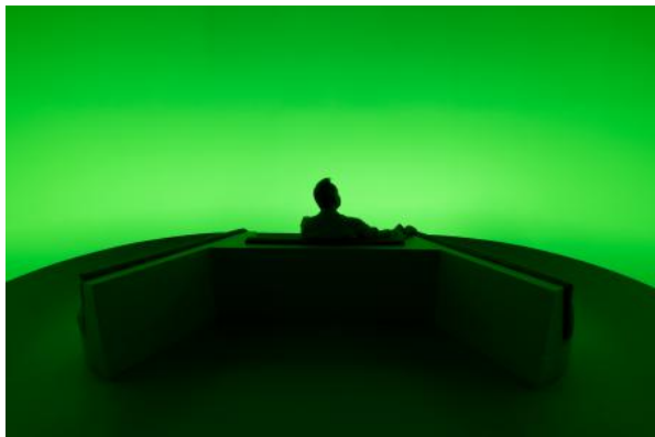
Chasing The Dot, 2024