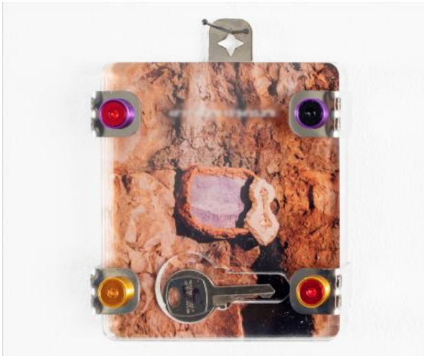
Disclaimer: Artwork May Already be Gone, 2024 Key, plexiglass, Lasercut Metal, Hahnemühle baryt print, rivets, 10x9