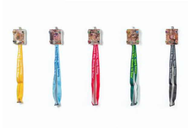
Disclaimer: Artwork May Already be Gone, 2024 Key, plexiglass, Lasercut Metal, Hahnemuhle baryt print, rivets, lanyard, 40x100