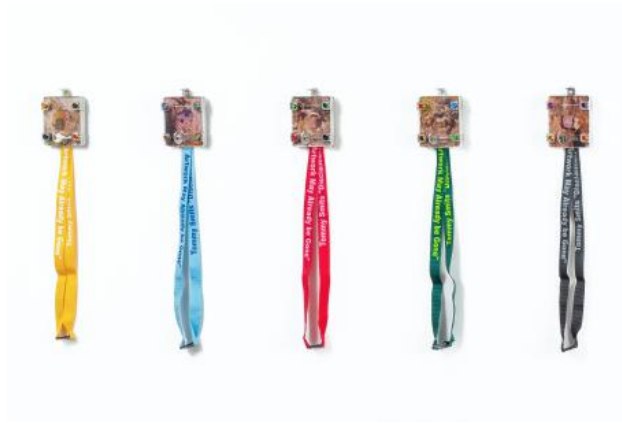
Disclaimer: Artwork May Already be Gone, 2024 Key, plexiglass, Lasercut Metal, Hahnemühle baryt print, rivets, lanyard, 40x100