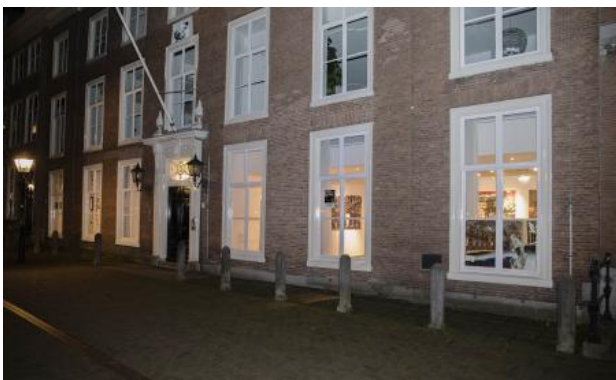
Reality seems well defined, 2021 prints, diverse