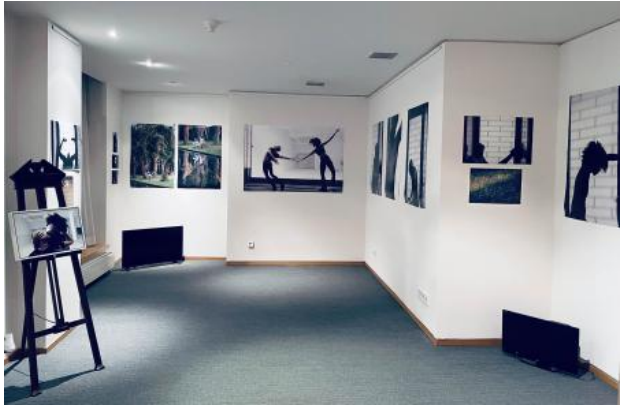
Reality seems well defined, 2021 prints, diverse