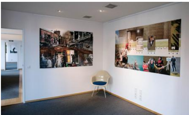
Reality seems well defined, 2021 Prints, 200 x 120 cm.