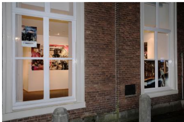
Reality seems well defined, 2021 Prints, diverse