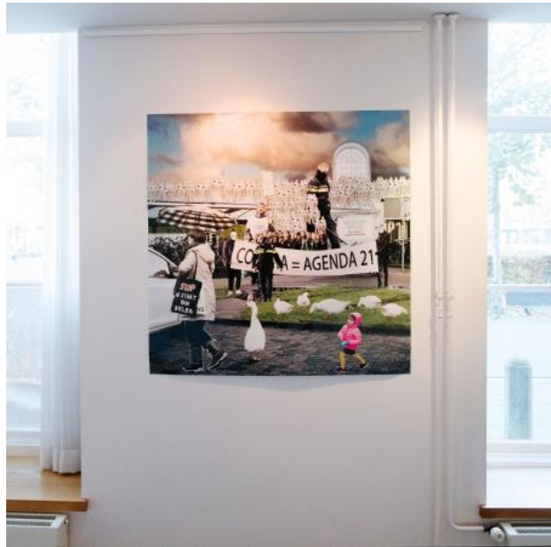
Reality seems well defined, 2021 Print, 120 x 120 cm