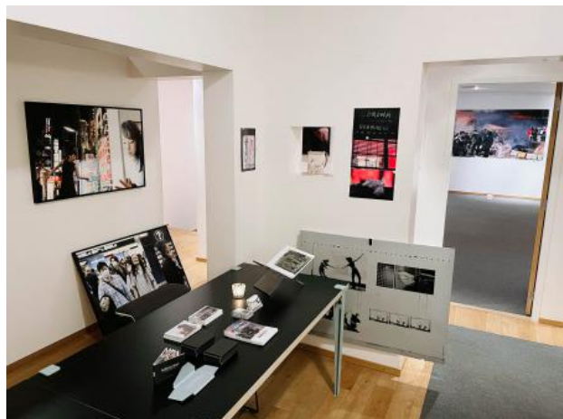
Reality seems well defined, 2021 prints, diverse