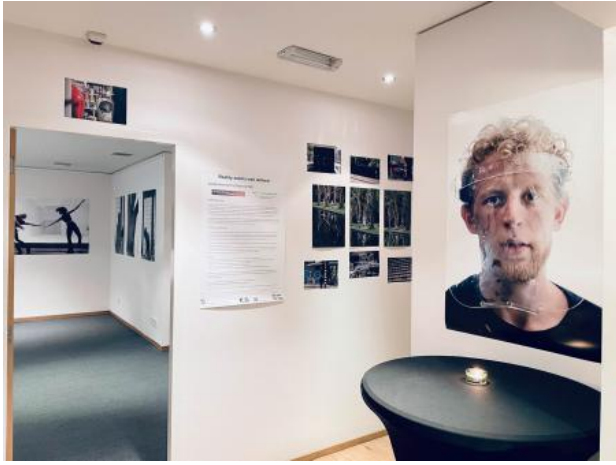
Reality seems well defined, 2021 prints, diverse