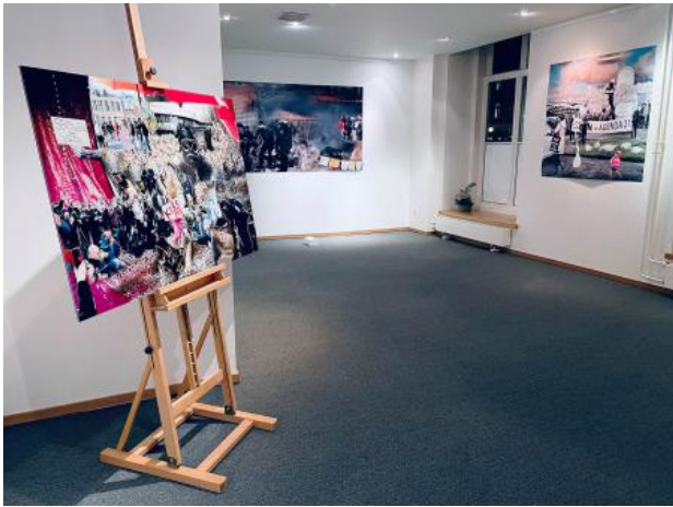
Reality seems well defined, 2021 Diasec, 120 x 80 cm