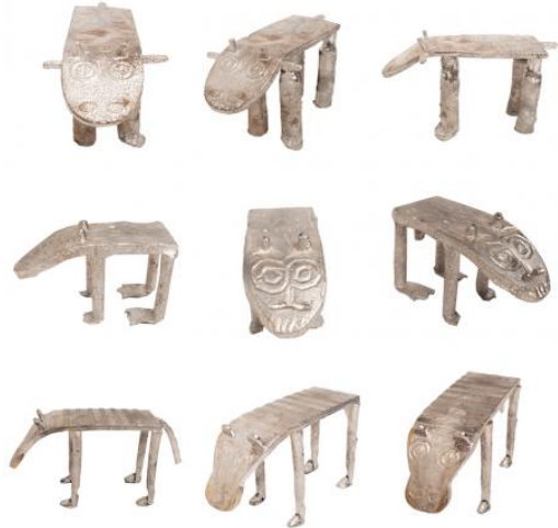
Jungle farm, 2021 Aluminum Casts, Variable