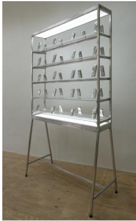
Fast Lane, 2022