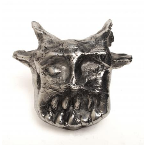
El Diablo, 2021 Aluminium Cast, 10x10x5