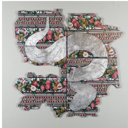
Masuri, 2023 Aluminium cast, textile, PET G, 1x1x0.06m