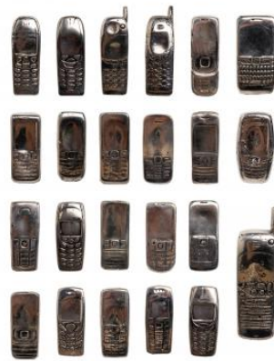
Nokia Collection, 2021 Aluminum (remelted from old Amsterdam metro line), Variable