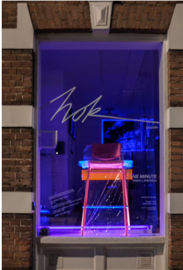
"One Minute," , 2020 installation, photography, mixed media