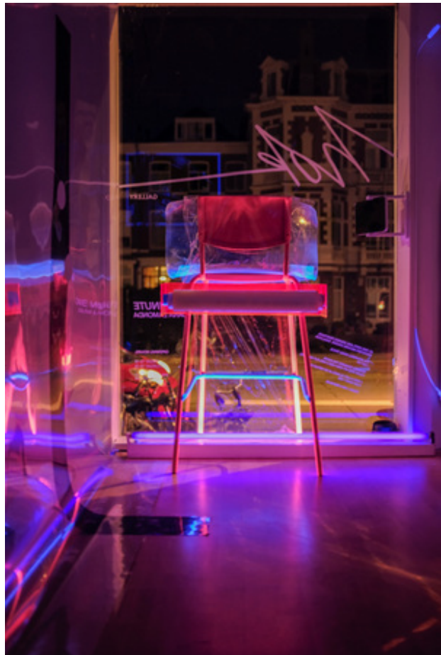
"One Minute," 2020 installation, photography, mixed media