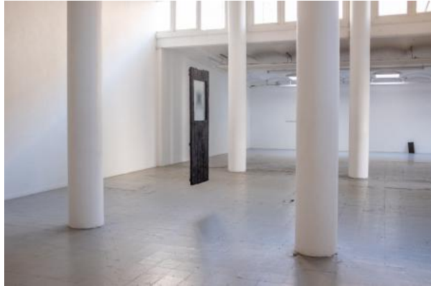
Vanishing Point, 2022 Mixed Media, 75x200x5 cm