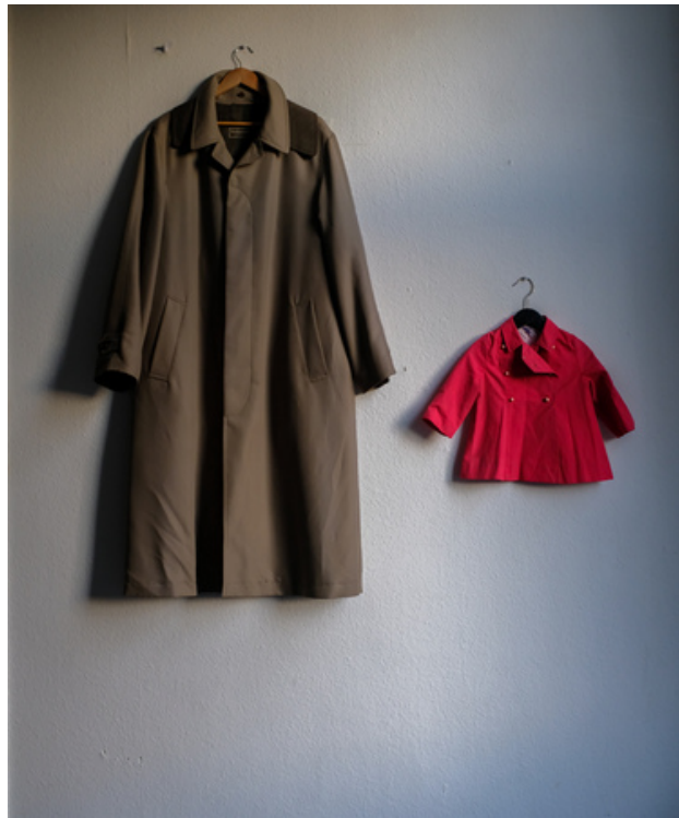
The Studio, Papa Rene in Retrospect, 2020 Installation