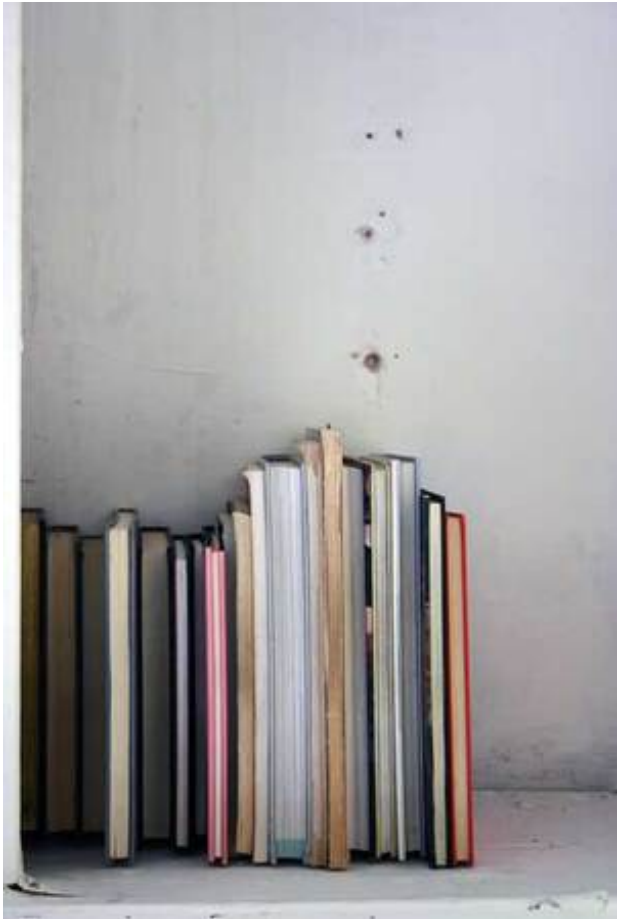
Books, 2021 installation