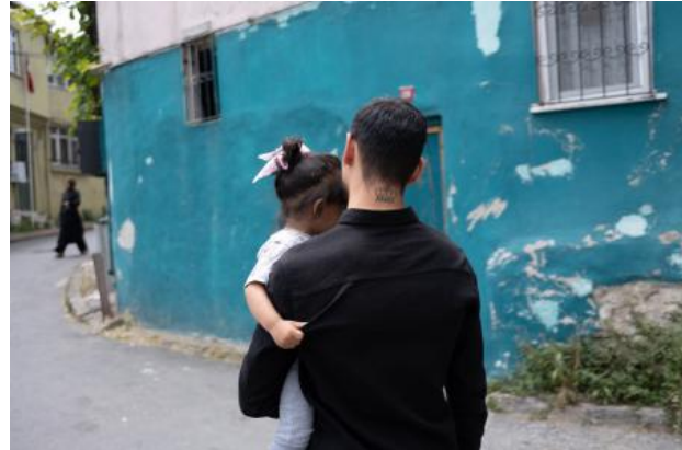
Rotterdam Photo 2024, 2024 Photography