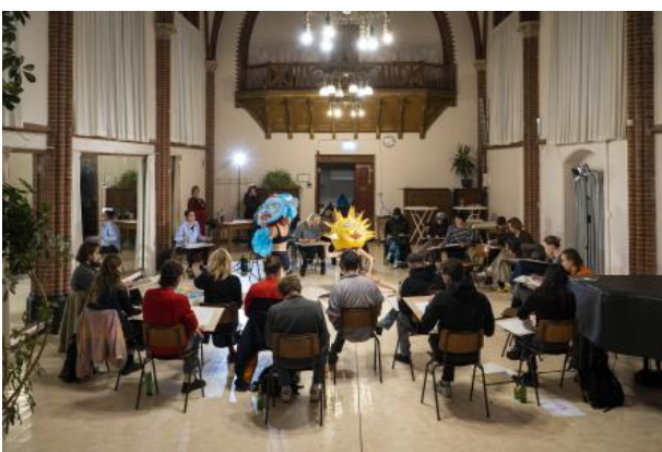
The North Wind and the Sun, 2023 paper mache, fabric, n/a

Ongoing Entertainment Project (Bouquet), 2024