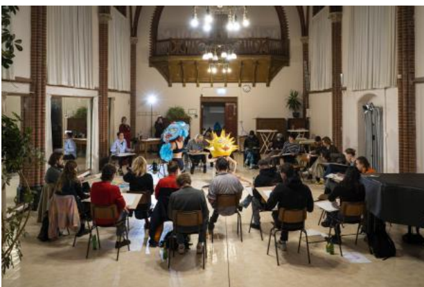
The North Wind and the Sun, 2023 paper mache, fabric, n/a

Ongoing Entertainment Project (Bouquet), 2024