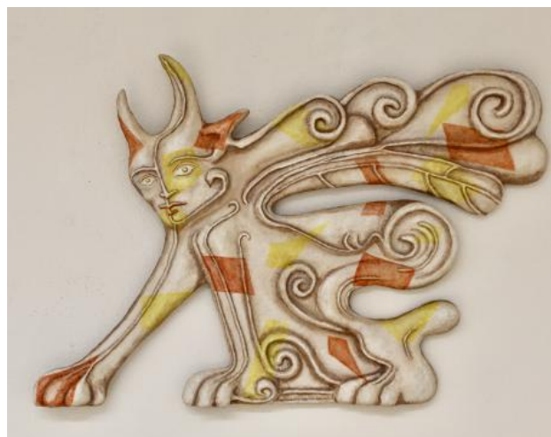
Stared Too Long, 2024 paper mache, paint, 60x75x6cm

Ongoing Entertainment Project (Touch Vibration), 2024