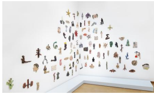
Talismagic, 2022 glazed ceramics, installation