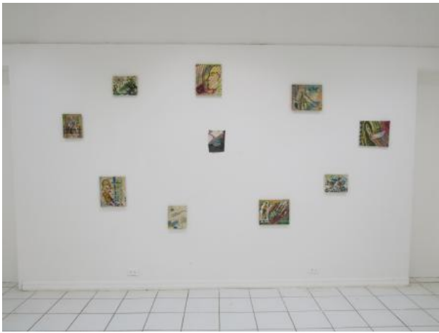
ateliers'89 installation, 2024