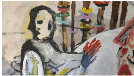
detail as above, 2021 oil, acrylics, charcoal, pencil on canvas, 120 x 140