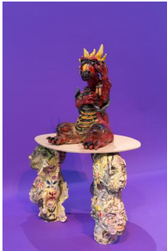
Dragon & The Magic Mountain, 2023 glazed ceramics, installation