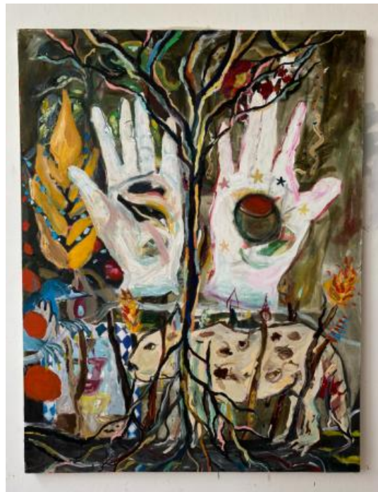
wood wide web, 2021 oil paint, acrylics on canvas, 150 x 115