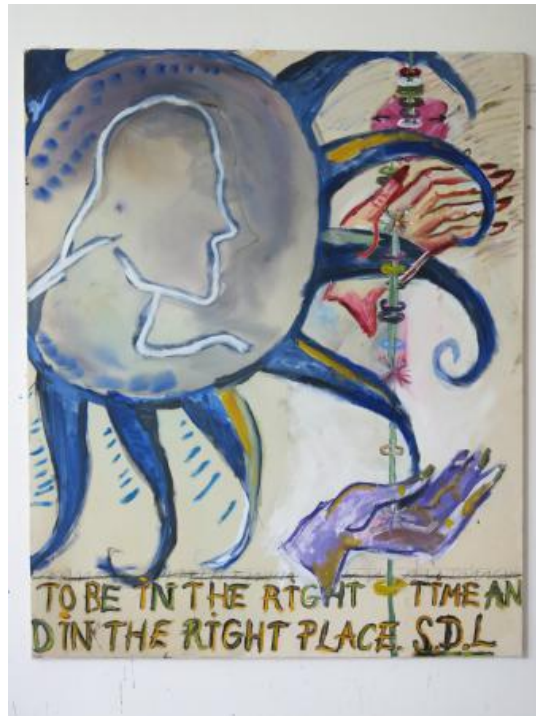
Right Time Right Place, 2023 oil paint, acrylics on canvas, 150 x 130