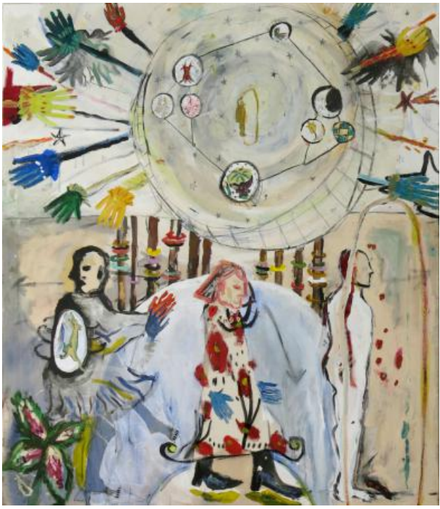
As Above, 2020 oil, acrylics, charcoal on canvas, 120 x 140