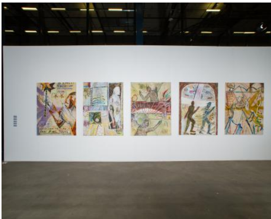
art rotterdam, 2023 oil, ecoline, acrylics, charcoal, pastel on canvas