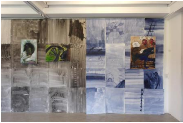
Magie installation view, 2022 acrylics on paper, canvas, installation