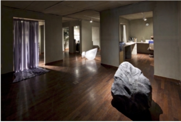
The Unnameable, 2013