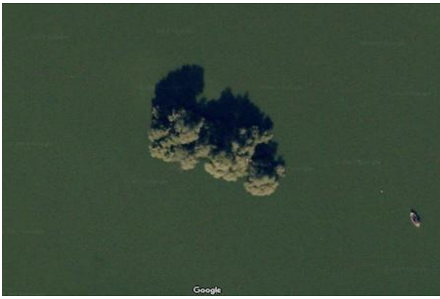
The Christmas Trees Project 1: The Christmas Trees Island, 2020