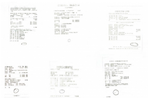
The Smiling Signature Project, 2016