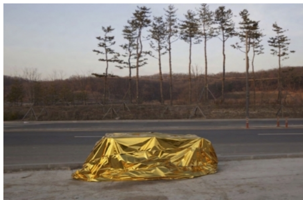
The Wrapping project, 2015