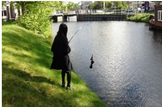
The Black Umbrella TM-R-869, 2017