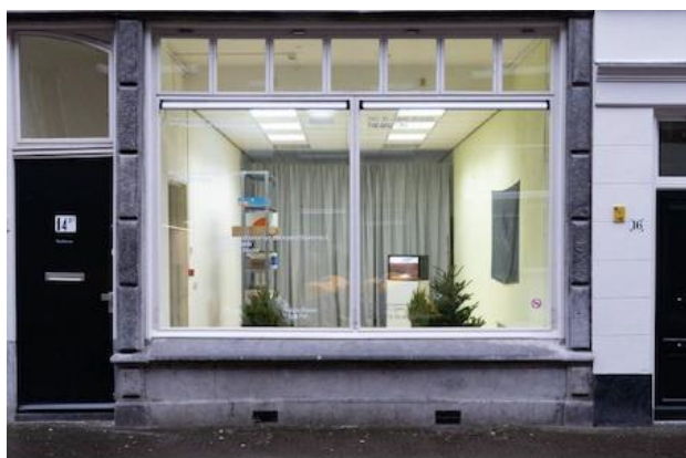
The Christmas Trees Project2, 2022