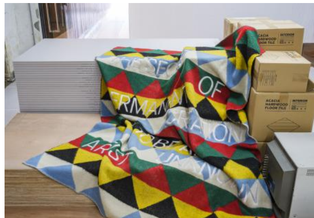
Blanket Resistance, 2023