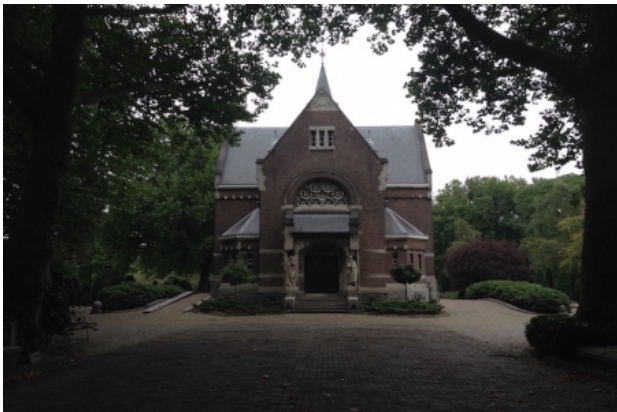
The Unknown Person's Funeral, 2018