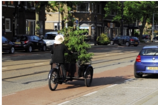
The Christmas Trees Project, 2018