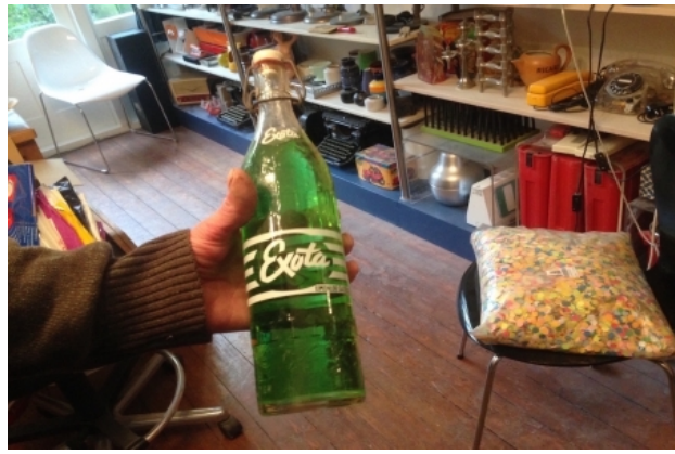
The (In)Visible Vintage Shop, 2018