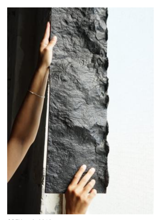
OBEX no.2, 2019 mixed media, 90cm x 40cm x 25cm