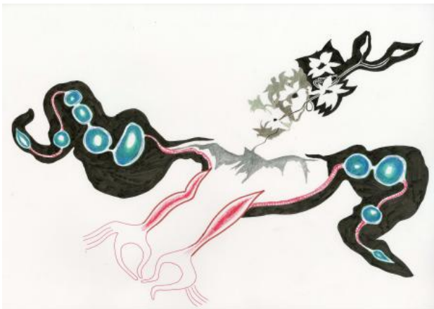
hands, 2023 pencil and marker on paper