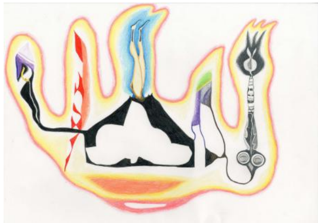
hand, 2023 pencil on paper