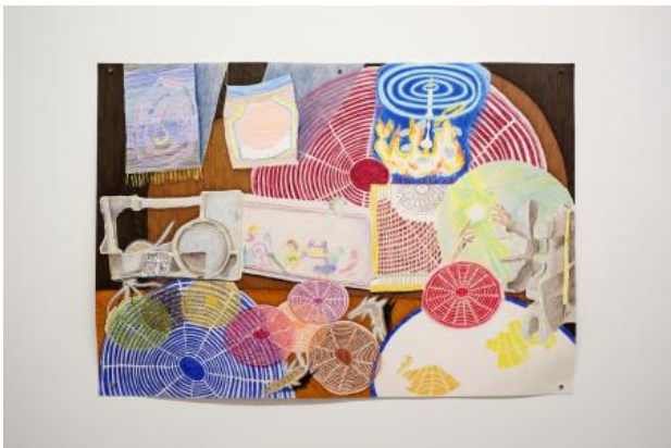
The myth of the silverfish pt. 1, 2022