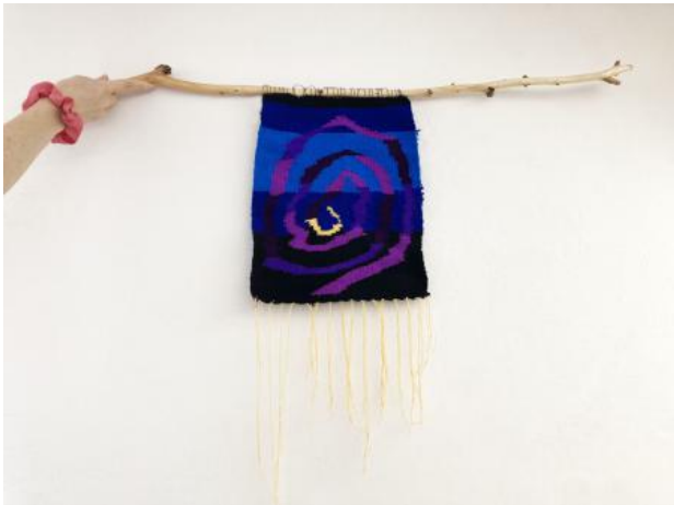
january, 2022 weaved cotton and wool