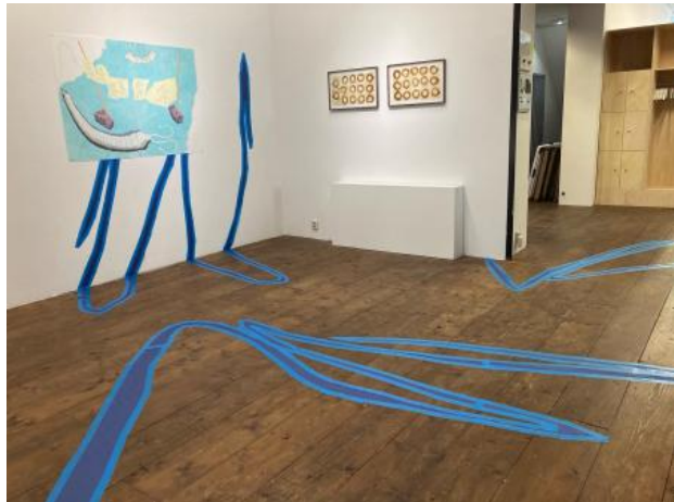
The myth of the silverfish pt. 1, 2022 Drawing, print, publication, animation, and spatial installation, variable