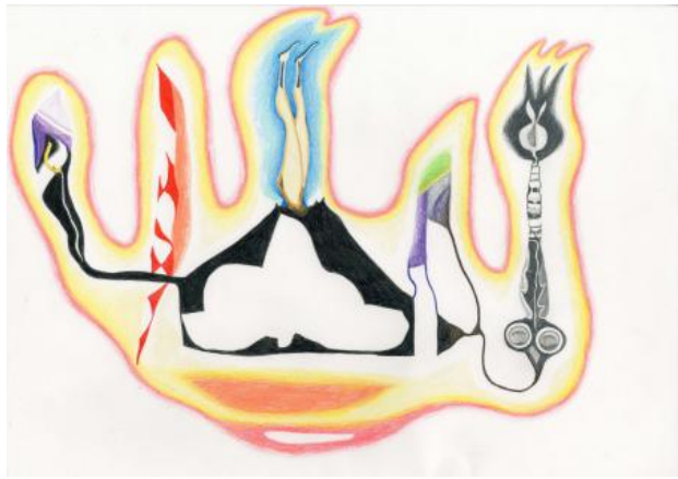
hand, 2023 pencil on paper