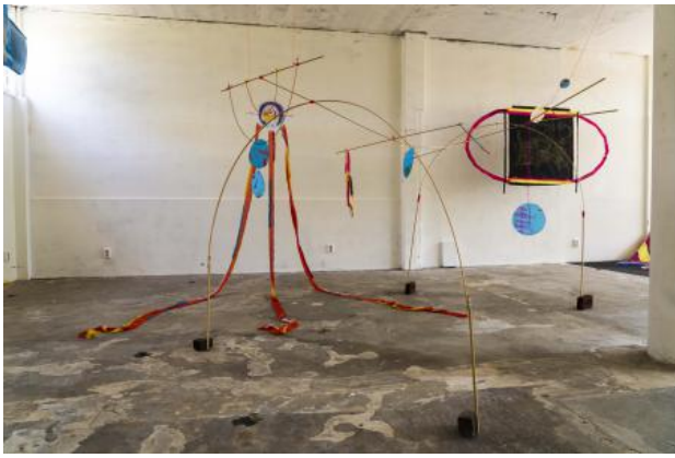
Installation shot of show at Lab23, 2023