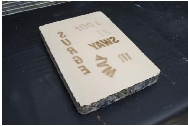
3DOF 2T1R (Rigid body moving through space), 2023

canvas: 75 x 95 cm, publication: 128 x 17 cm