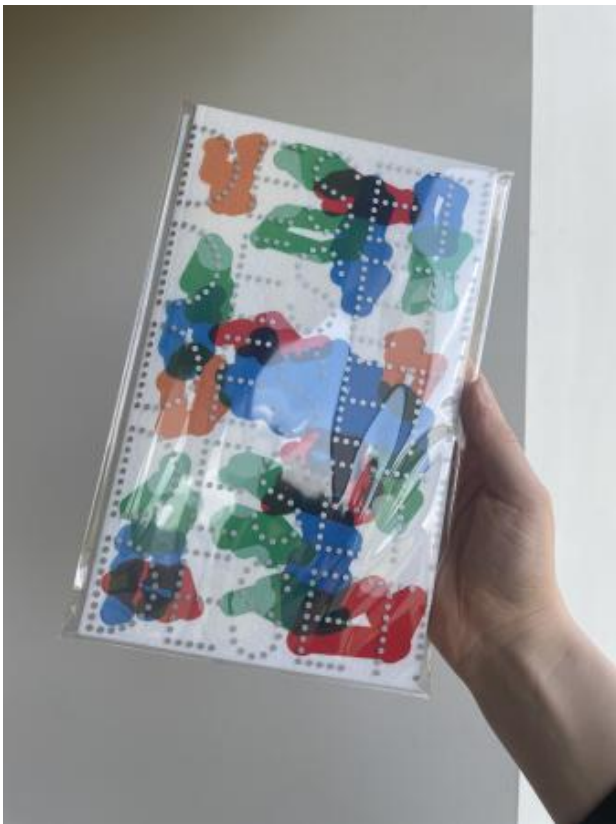
DESET!, 2024 inside: riso, cover and sleeve: silkscreen, 27 x 16 x 0,7 cm