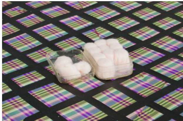
Detail, A situation, 2023

Silk, heat transfer foil, metal, resin, wax in cotton wool and shoes, 190 x 85 x 43 cm