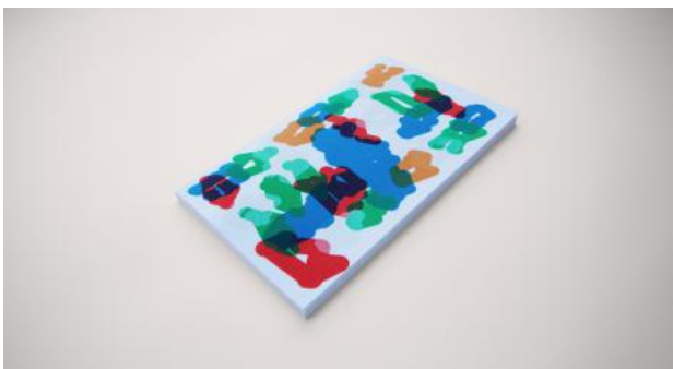
DESET!, 2024 inside: riso, cover: silkscreen, 27 x 16 x 0,7 cm