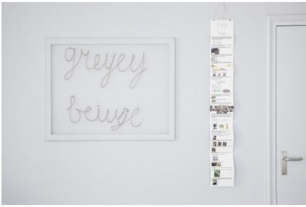
Greyey Beige, 2023

canvas: silicone on organza and wooden frame.