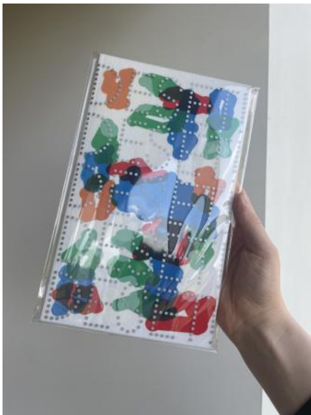
DESET!, 2024 inside: riso, cover and sleeve: silkscreen, 27 x 16 x 0,7 cm