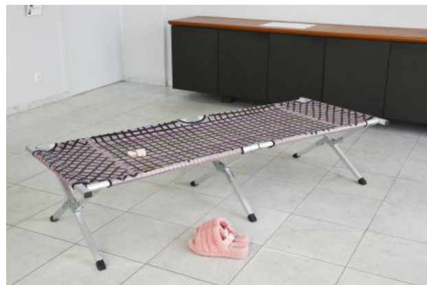
A situation, 2023 Silk, heat transfer foil, metal, resin, wax in cotton wool and shoes, 190 x 85 x 43 cm