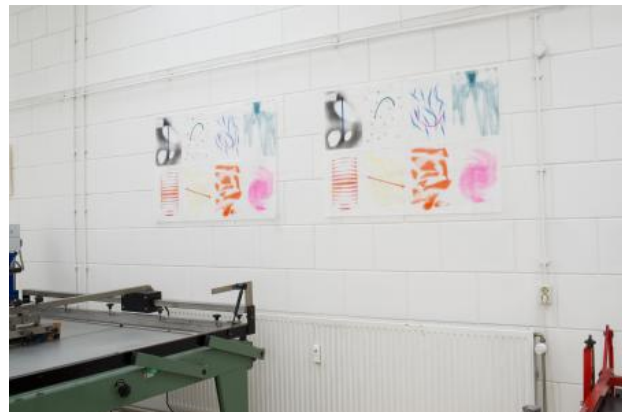
Freedom/Effort (riso), 2023 Riso print on folded Japanese paper, 84x118 cm