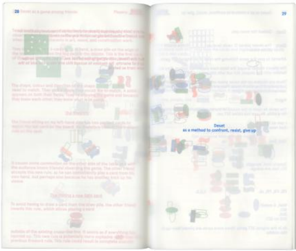
DESET!, 2024 inside: riso, cover: silkscreen, 27 x 16 x 0,7 cm