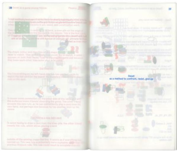
DESET!, 2024 inside: riso, cover: silkscreen, 27 x 16 x 0,7 cm