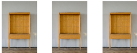
where is everybody, 2018 Digital C-Print, 70x45cm

2015 - Teaching Informal Master's students at 2015 CCA Tbilisi, Georgia