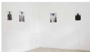
A Walk, 2016 Digital C-print, variable