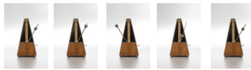
green ray, 2017 digital c print, 70x54