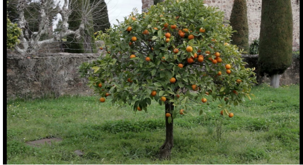
mandarin tree, 2017 30 sec video loop

practising landscape, 2018 digital c print, 54x36