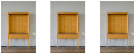
where is everybody, 2018 Digital C-Print, 70x45cm

2015 - Teaching Informal Master's students at 2015 CCA Tbilisi, Georgia