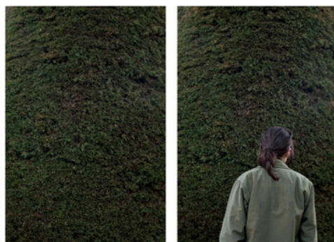
Untitled, 2016 Digital C print, 40x60