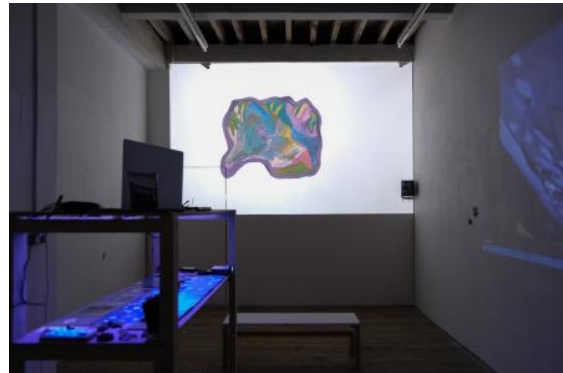
Reading Slippages, Writing Interstices, 2023