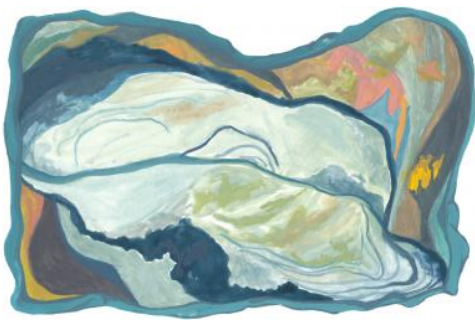
Reading Slippages, 2023 Watercolour on paper