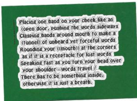
(how do you sound a bracket?), 2023 Publication