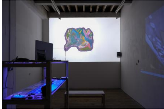
Reading Slippages, Writing Interstices, 2023