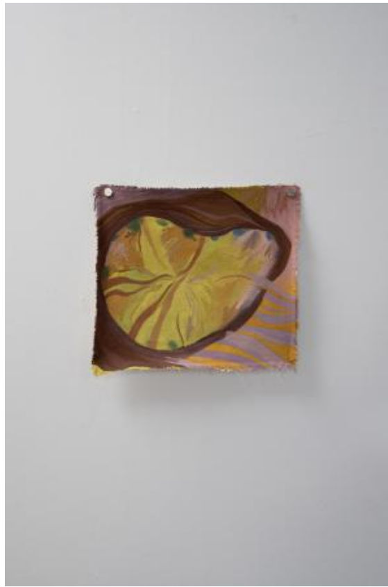
Reading Slippages (a small painting series), 2024 Gouache on canvas