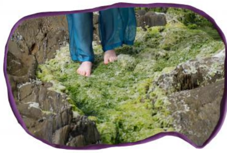
Reading Slippages, 2024 Animation Still