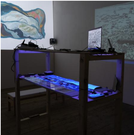
Reading Slippages, Writing Interstices, 2023