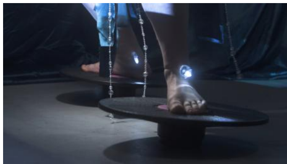
Pulp of the Sea (performance), 2021 Film