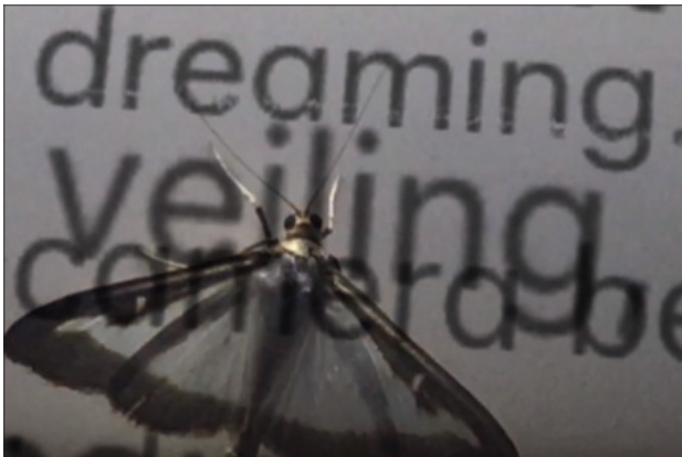
The Butterfly Dream, 2021 digital video & MiniDV, 640 x 960 pixels