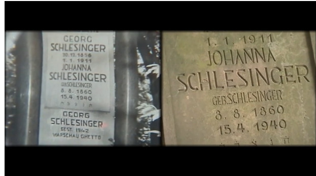
I've to Think Not Twice, but Twice Twice, 2022 3 minutes