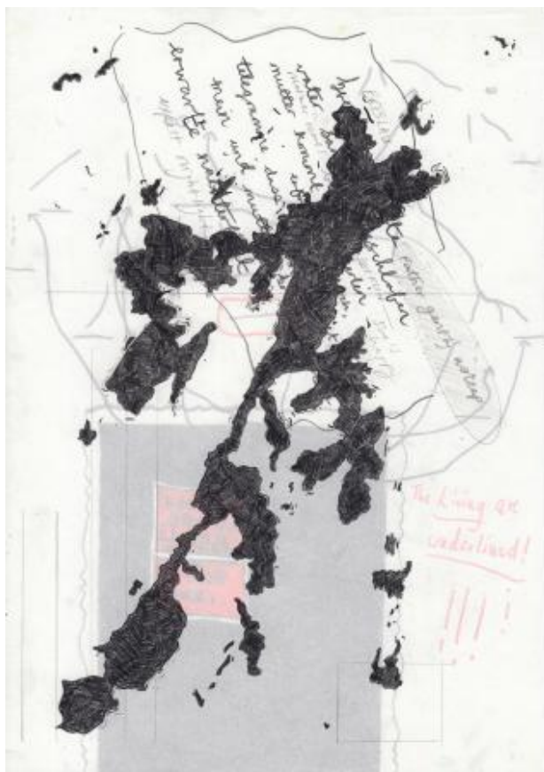
Father Gently Asleep (from the series Little Odes), 2023 Pencil on transparent paper, 210 x 297mm