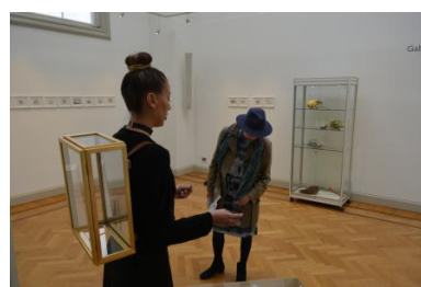
Amethyst - Pulchri Studio , 2021 Various., Variable