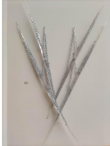
Installation at Exhibition The Roaring 20's, 2021 Sculpture., 250cm x 150cm x 20cm