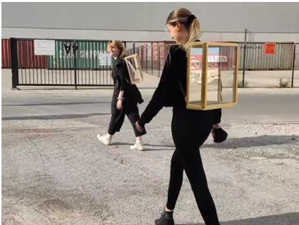
KONVOOI FESTIVAL - BRUGGE BELGIUM, 2021

2019 - Working as a guide at the Museum 2019 Voorlinden On-going