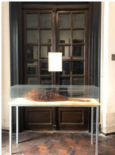
S/T , 2021 Sculpture and writing., 180cm x 150cm x50cm