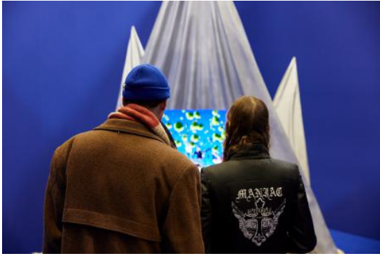
You are light and cabbage, 2023 video sculpture, 300 cm x 250 cm x 250 cm