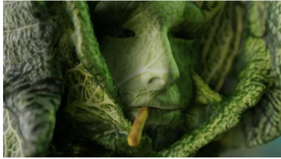
You are light and cabbage, 2023 video still