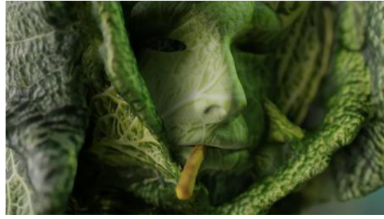
You are light and cabbage, 2023 video still