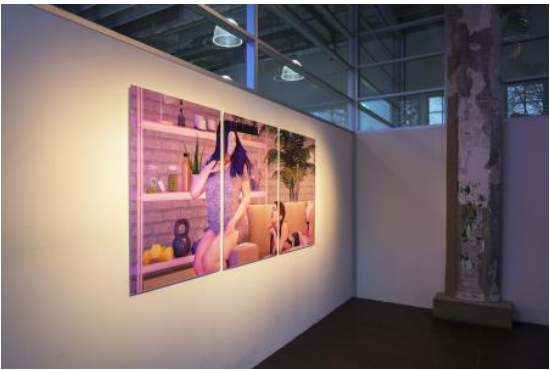
Super Confident, 2021 Uv print on acrylic, 240 x 100 cm, triptych