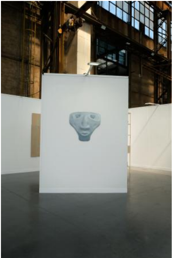
Lucky charm to remove all your trauma, 2023 digital print, Various sizes