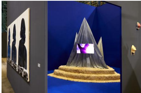
You are light and cabbage, 2023 video sculpture, 300 cm x 250 cm x 250 cm