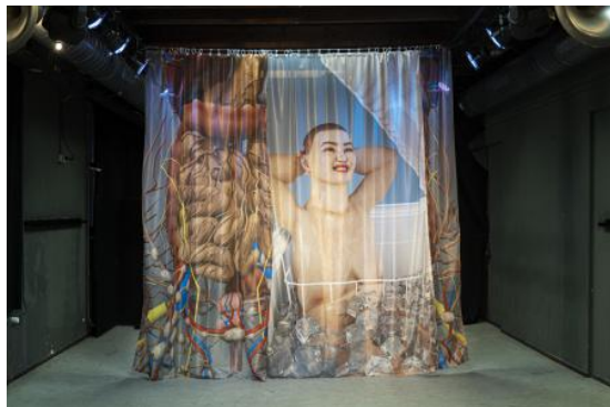
Ice Bath, 2021 Digital print on polyester, 535 x 350 cm