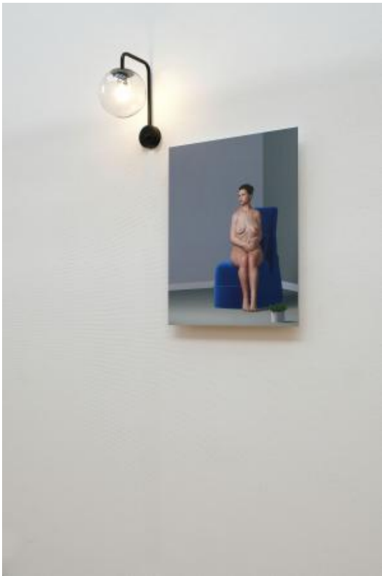
Untired, 2021 UV print on aluminium, lamp, 60 x 75 cm