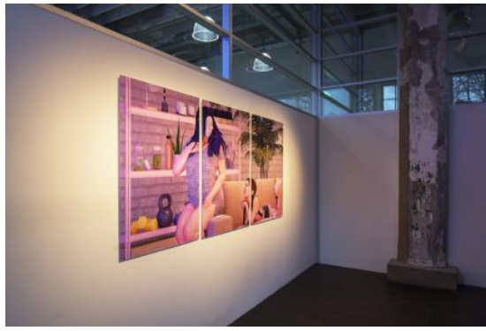
Super Confident, 2021 Uv print on acrylic, 240 x 100 cm, triptych