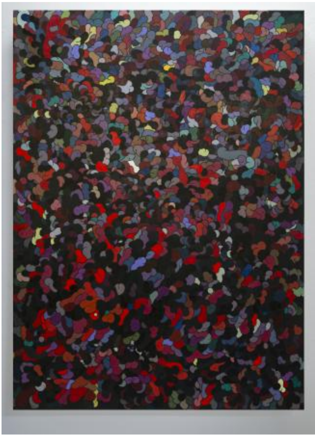
An entrance to, vol.2 , 2023 Acrylic on canvas, 200 x 145 x 5 cm