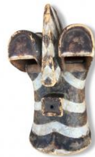
the Mask: True, I have raped history, but it has produced some beautiful offspring, 2021 African mask(replica) covered with the diamonds(replica), 30 x 19 x 19cm