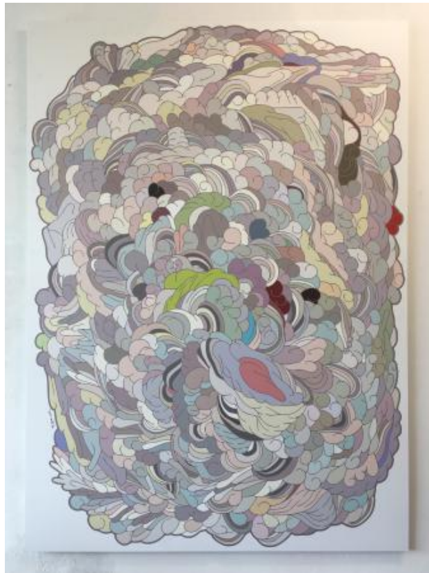
Anaphase1, 2022 drawing, digital print on PVC, 170 x 125 cm