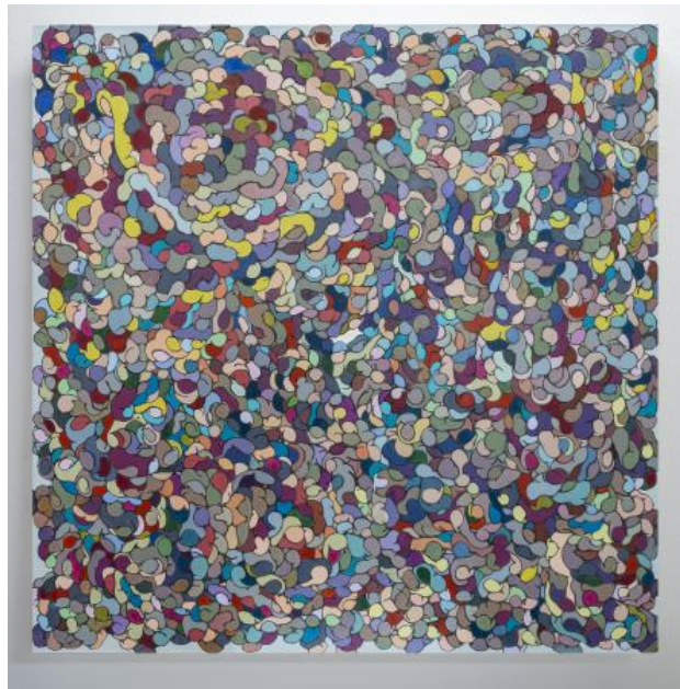
An entrance to, vol.3 - retina of a painter , 2023 Acrylic on canvas, 145 x 145 x 5 cm