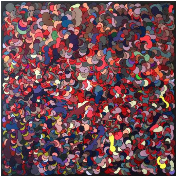
An entrance to , 2022 acrylic on canvas, 125 x 125 cm