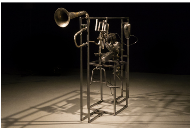
The Last Song of a Two Stroke Engine, 2020