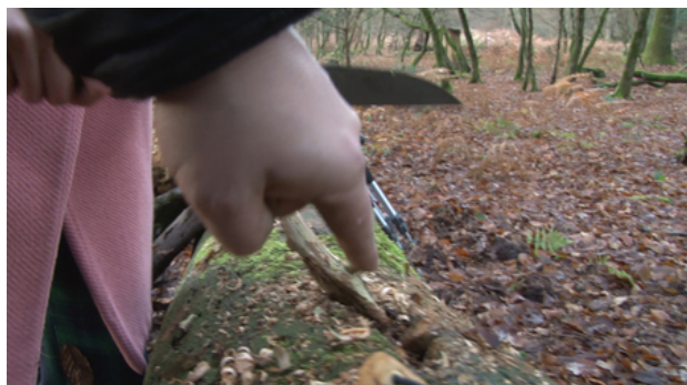
We´ll have time for that later, 2019 Film