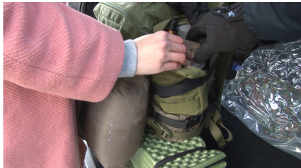
We´ll have time for that later, 2019 Film