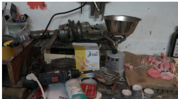
We´ll have time for that later, 2019 Film