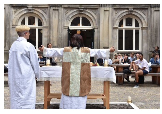
Holy Mass, 2019 Participatory Performance, 60 min, 7 days