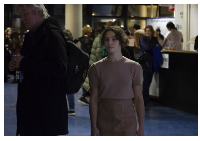
Touch, 2018 Participatory Performance, 5h, 3 days