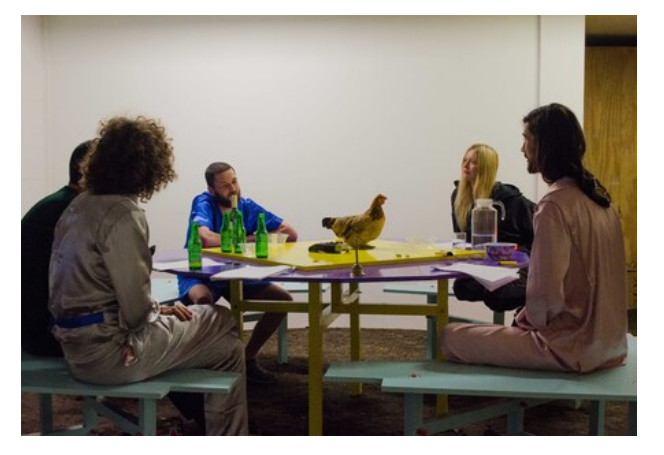
Food, 2018 Participatory Performance, 5 h