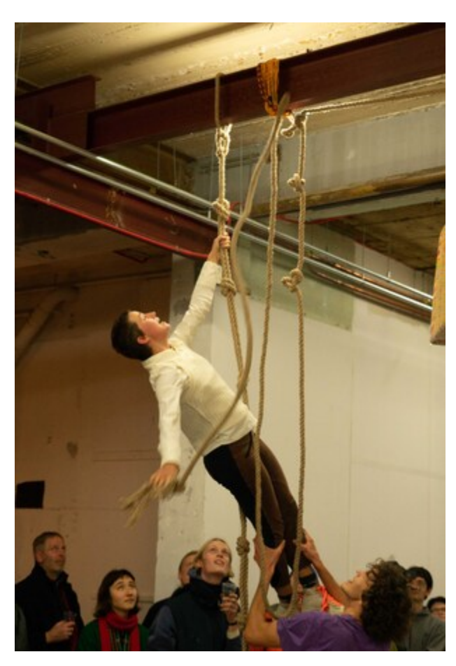
The Present , 2019 Participatory Perfromance