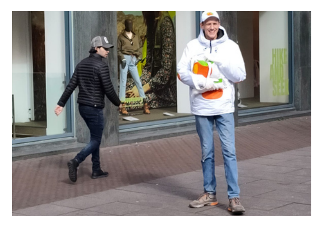
"Would you like a free mandarine", 2018 Participatory Performance, ongoing