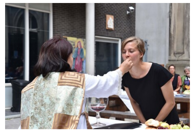
Holy Mass, 2019 Participatory Performance, 60 min, 7 days