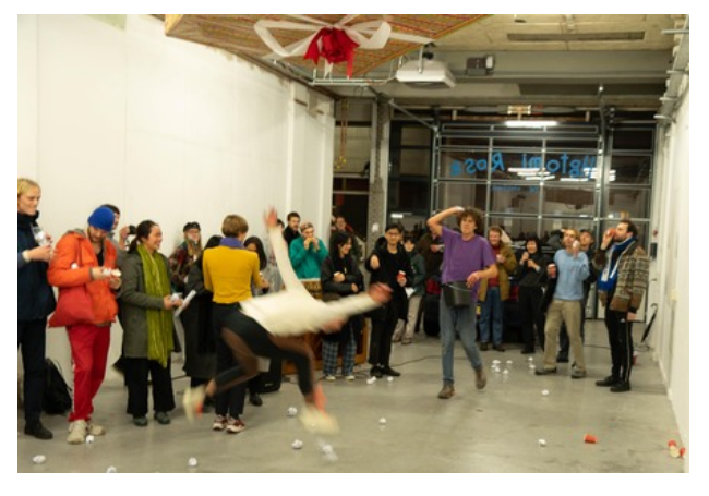
The Present , 2019 Participatory Perfromance, 30 min