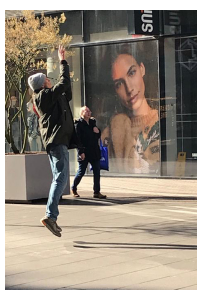
Invisible Basketball, 2020 Participatory Performance, ongoing

2017 Cloud@Danslab Den Haag, Netherlands Research of participatory art through immersive games. www.ludiccollective.com/1st-project