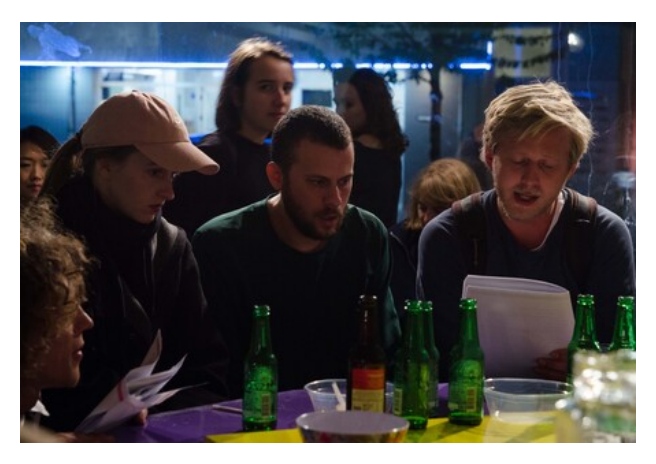
Food, 2018 Participatory Performance, 5 h