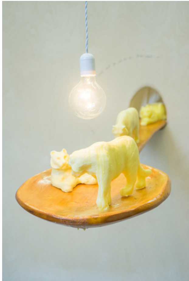
Meet tiger and go on, 2019 Welding, Molding, , room scale installation