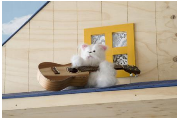
beautiful sunset, 2023