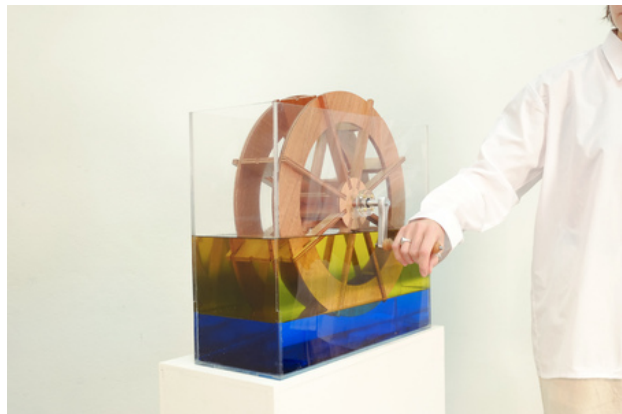
Fortune Wheel, 2018