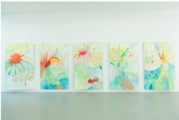
Halfway, Where, 2019 Water color on paper, 5.5m x 2m