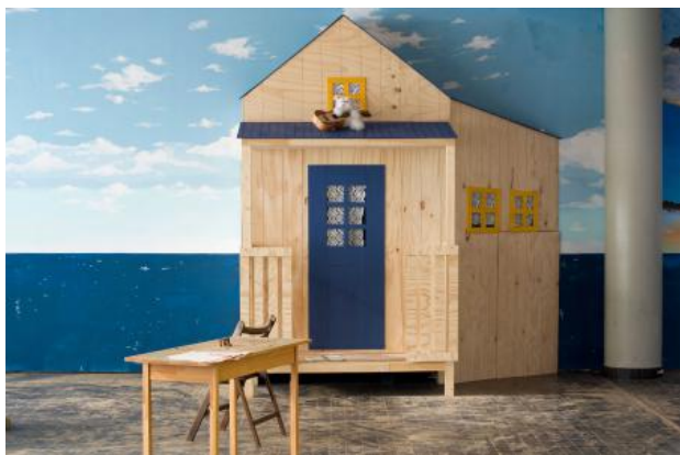
Beautiful sunset, 2023

2007 - Drawing and design teacher at 2018 Suidobata art school,