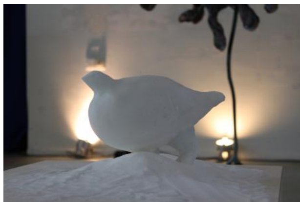
Legend of Rock ptarmigan, 2024 Salt made sculpture, 60cmx60cmx60cm