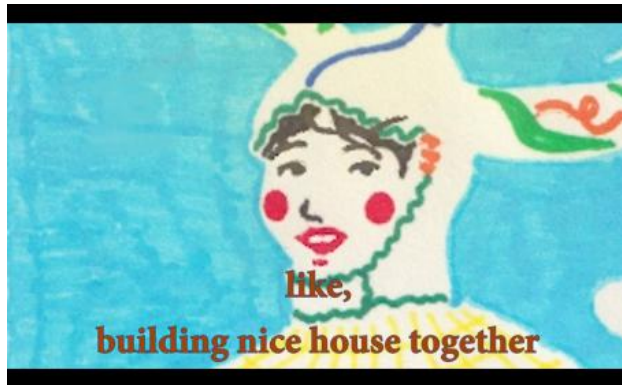
A boring story, 2022 digital animation (3:29)