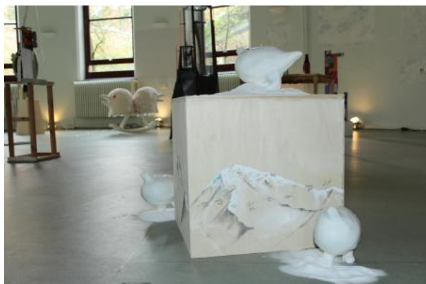
Legend of Rock pta, 2024