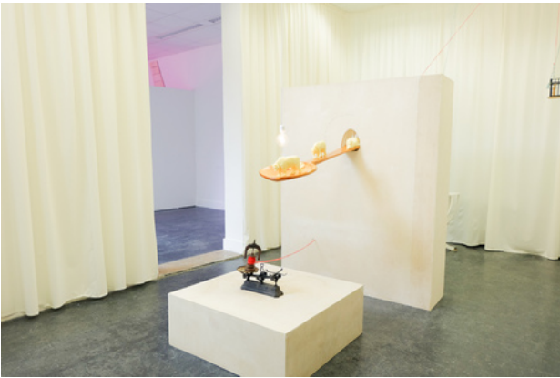
Meet tiger and go on, 2019 Welding, Molding, , room scale installation