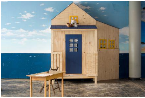
Beautiful sunset, 2023