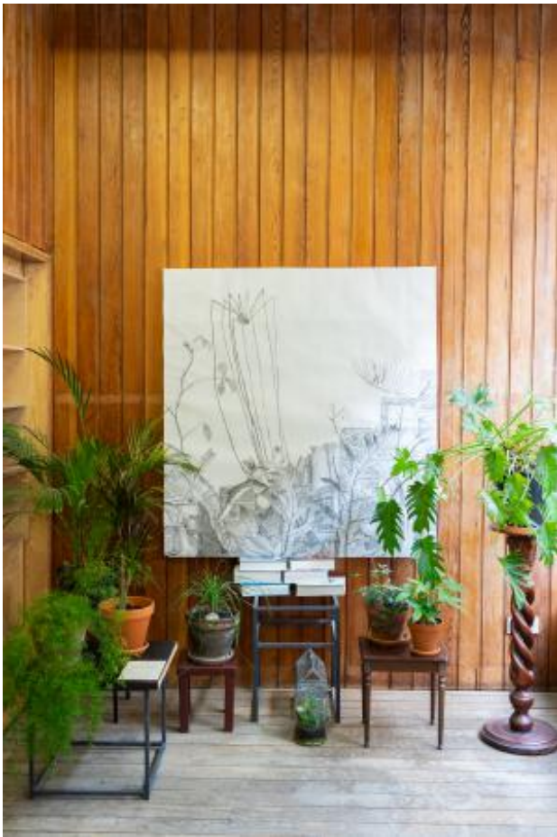
My room owner, 2022 hand drawing, pencil, 143cm x 143 cm