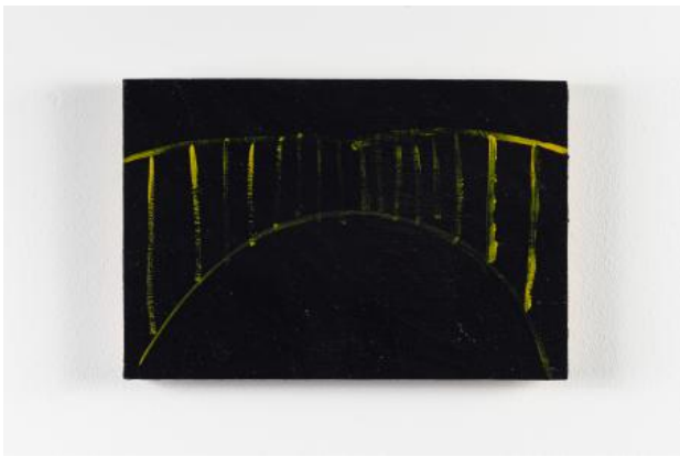
untitled , 2023 Oil paint on board, 30x20cm