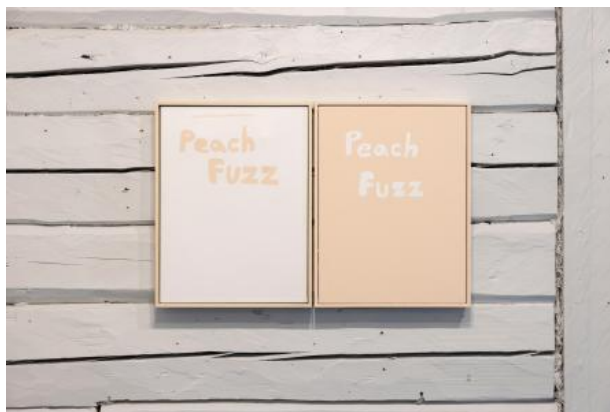
Peach fuzz, 2024 oil paint on canvas (framed), 30x40cm