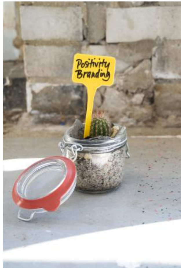
Acts of Opening #2: Kunst_Pflanzen, 2021