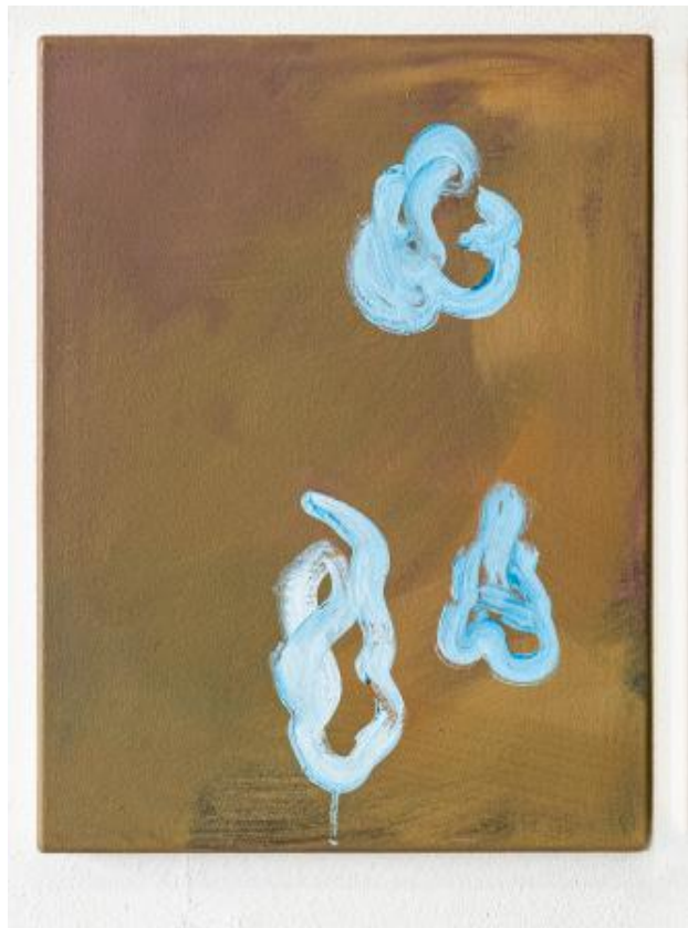
, 2023 Oil on Canvas , 30x40cm