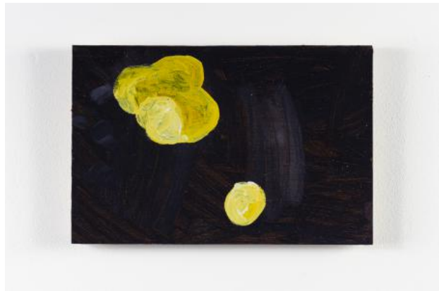
untitled, 2023 Oil paint on board, 30x20cm