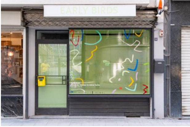
Early Birds, 2023