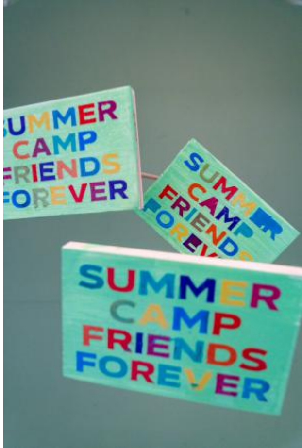
Early Birds, 2023