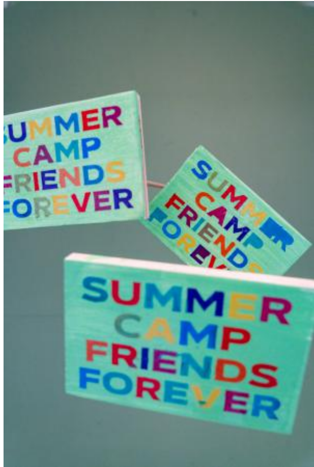
Early Birds, 2023