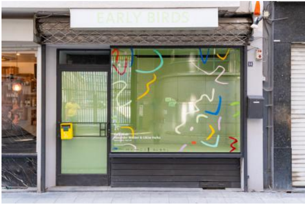
Early Birds, 2023