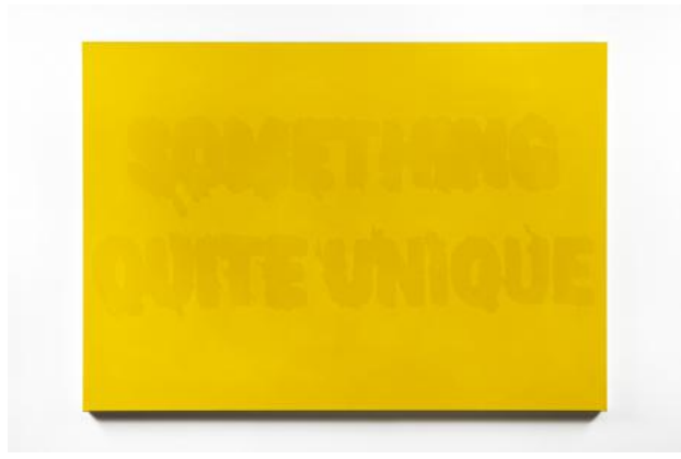
Something Quite Unique, 2023 Oil paint on cotton , 170x110cm