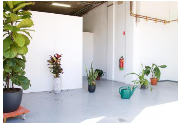
Acts of Opening #2: Kunst_Pflanzen, 2021