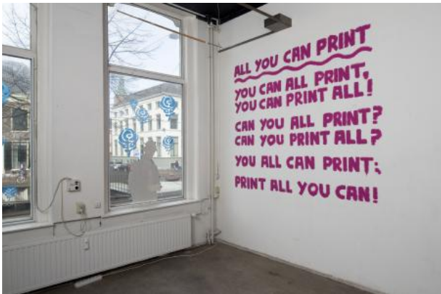
All You Can Print, 2023 Emulsion on wall