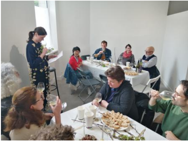
Vinous Landscapes #2 The Land is a coat of mail, 2023 Wine tasting performance