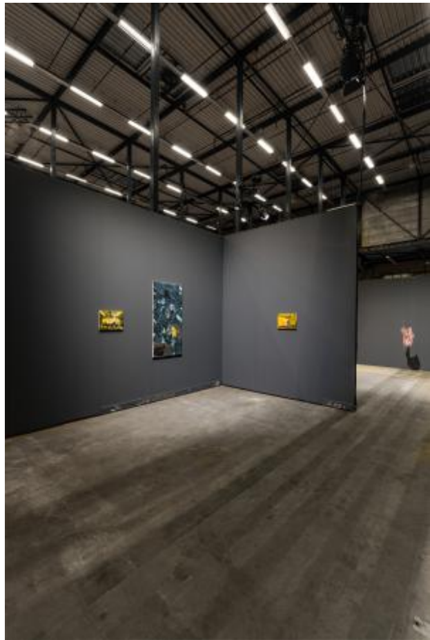
Prospects overview, 2024 Paintings and skirting board