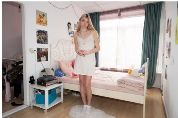
In My Room , 2023