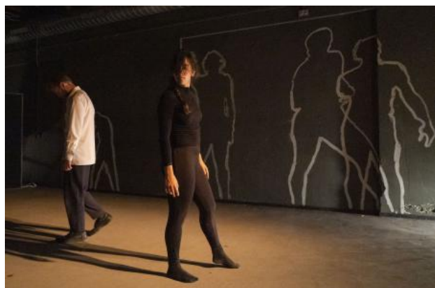
From Here We Go Sublime, 2021