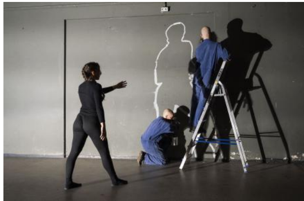
From Here We Go Sublime, 2021