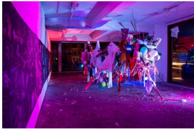
THE THING, 2022