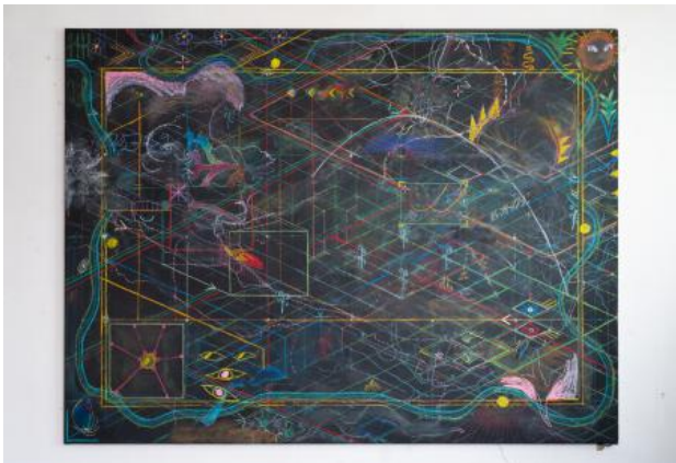
Ultrawork Nexus, 2022 pastel on canvas, 150 x 200 cm