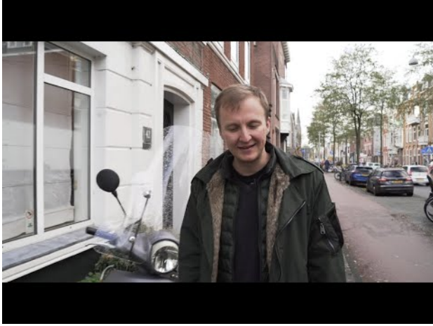
Your Sencirly, 2022 9 minutes