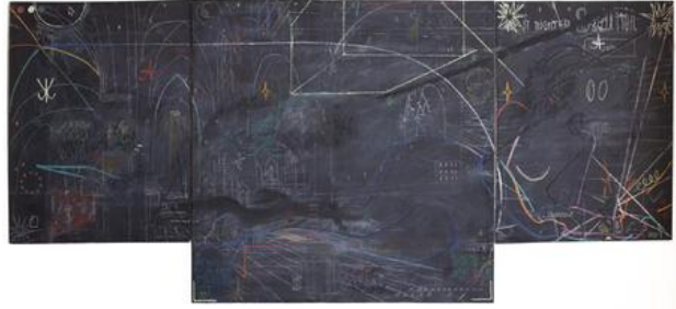
As I sit and ponder, a snail passes me by, 2020 Soft pastel on blackboard paint, 220 x 100 cm