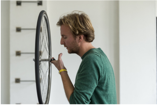
This Cycle, 2020