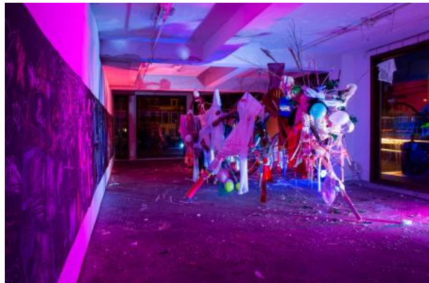
THE THING, 2022