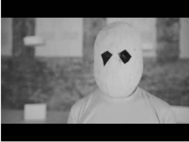
Catalysis, 2021 20 min