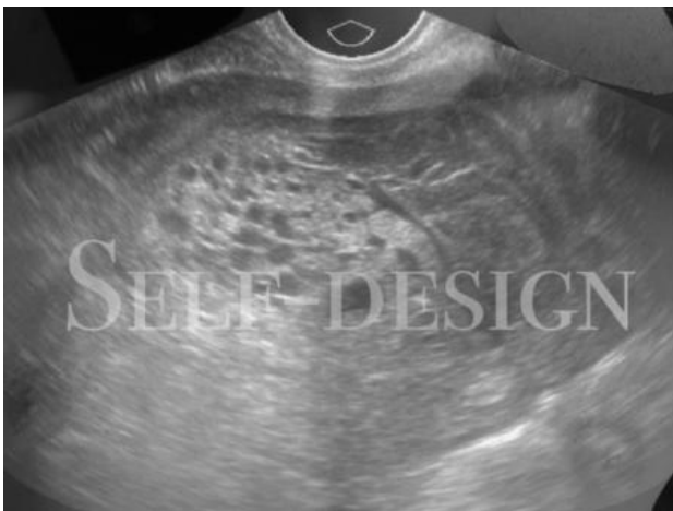
Logic of Events - spare parts, 2019 c-print on aluminum, 45 X 30 cm