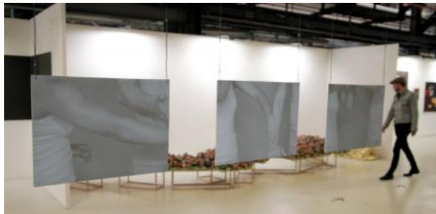
Folding in Reverse, 2021 3-channel video installation, sound, text. Projected on porcelain panels, 3x3x4 meter