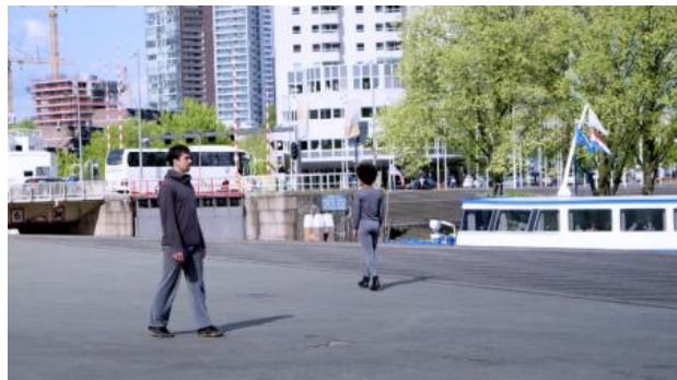
Potential Body's, 2018