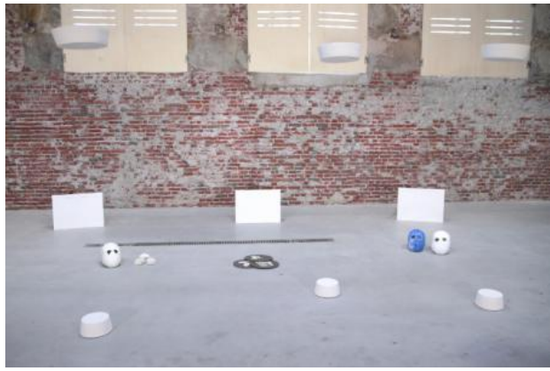
Error in Defoliation, 2021