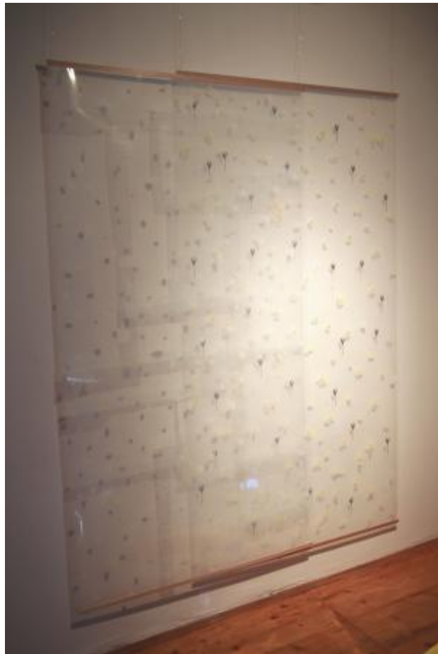
Cyber Story-Humanoids, 2020 tempera, wood, synthetic, 5 m x 7 cm x 2 m