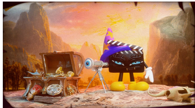
Hypnosis of the Stolen Painting- The Geographer, 2021 4min11sec