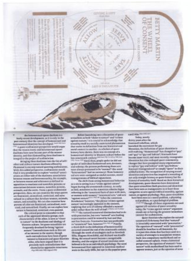
Wxch Craft Zine - Spring 22, 2022 Scan Ceramic, A5