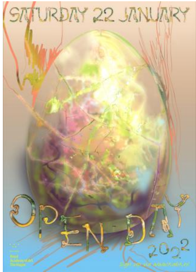
KABK Open Day 2022, 2022 Poster (ceramique, plaster, drawing, scan), 84 x 118,8 cm