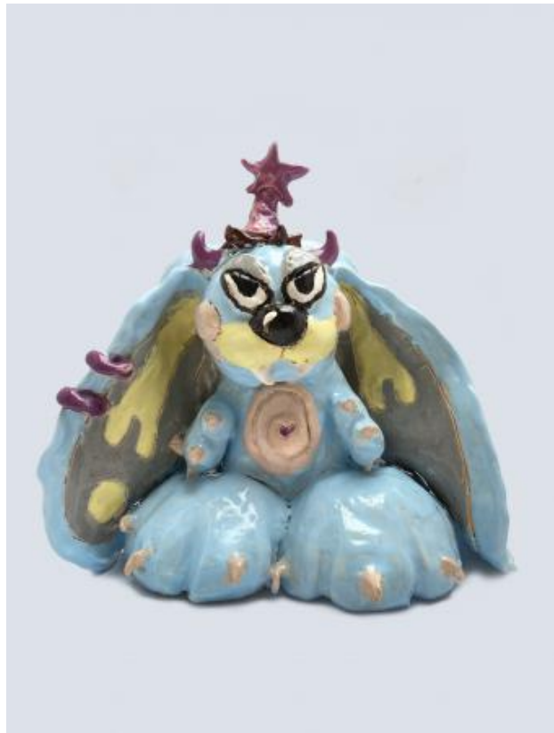
Lulu le Malin, 2022 Glazed Ceramic, 24cmx24