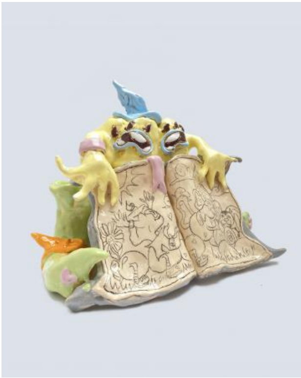
Legendes de la Citrouille, 2022 Glazed Ceramic, 17cmx28cm