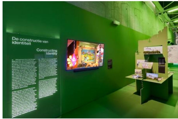
Hypnosis of the Stolen Painting- The Geographer, 2021 Video Work (3R renders, animation, interview), 1920x1080