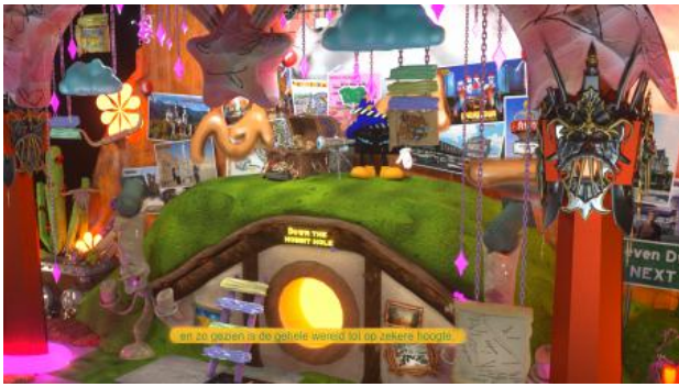
Hypnosis of the Stolen Painting- The Geographer, 2021 Video Work (3R renders, animation, interview), 1920x1080