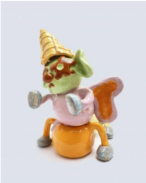
SirButter Billy Wiggle, 2022 Glazed Ceramic, 15cmx25cm