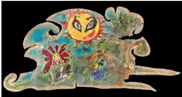
Jardin des Golems, 2021 Glazed Ceramic, 60cmx37cm