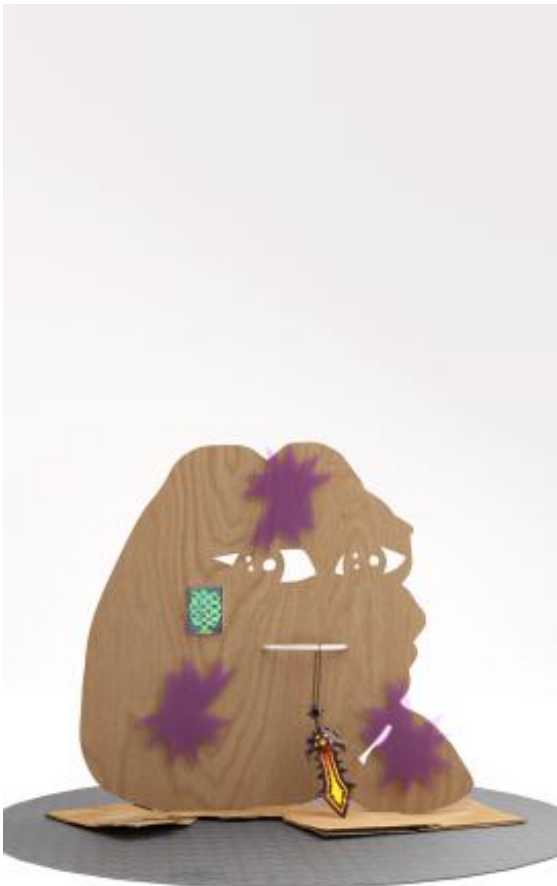
A/B, 2023 Mixed, 100x140 cm