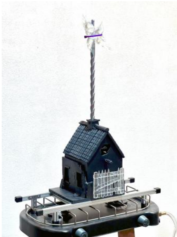
House_Basic, 2023 Mixed