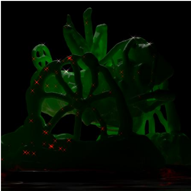
Cannon , 2024 CGI