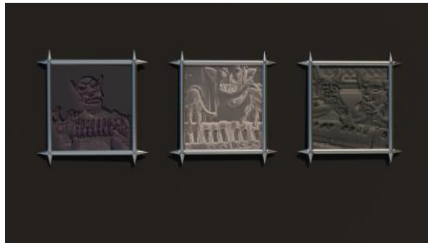
Geblens , 2023 Mixed Technique, each 50x50 cm