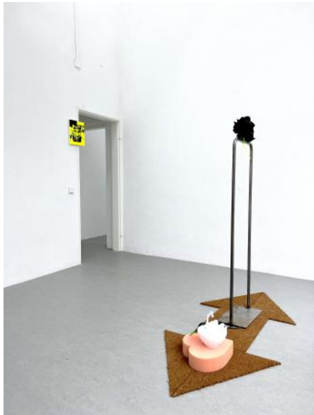
disruptainment dread, 2023 Mixed Technique