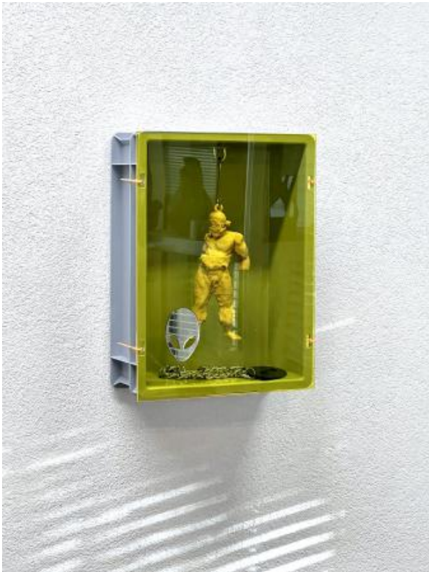
my radical friend , 2023 Mixed Technique, 30x40x7 cm