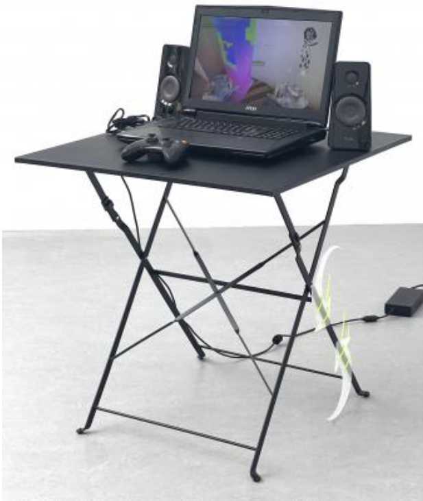
disruptainment dread, 2023 Mixed Technique, Infinite duration