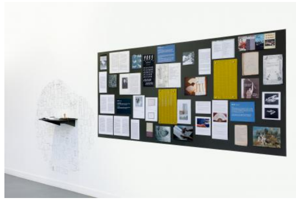
Scold, Gossip and Siren, 2023