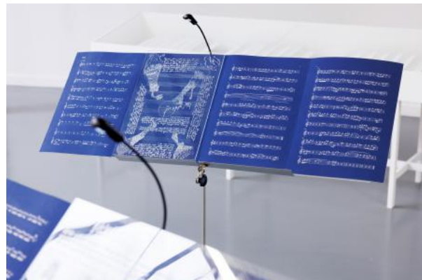
Siren, as part of Scold, Gossip and Siren, 2023