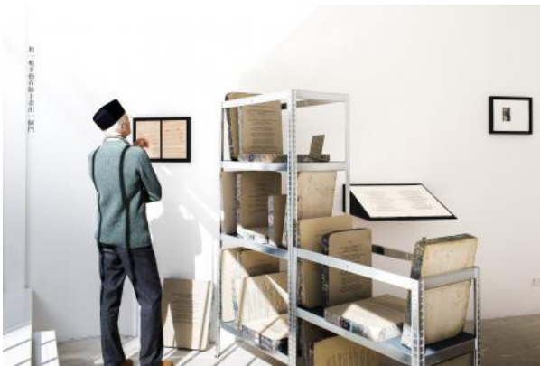
What Kinds Of Times Are These, When To Talk About Trees Is Almost A Crime, 2023