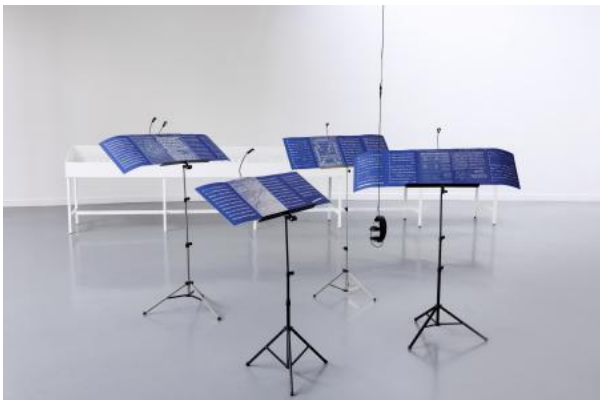
Siren, as part of Scold, Gossip and Siren, 2023