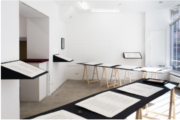
What Kinds Of Times Are These, When To Talk About Trees Is Almost A Crime, 2023