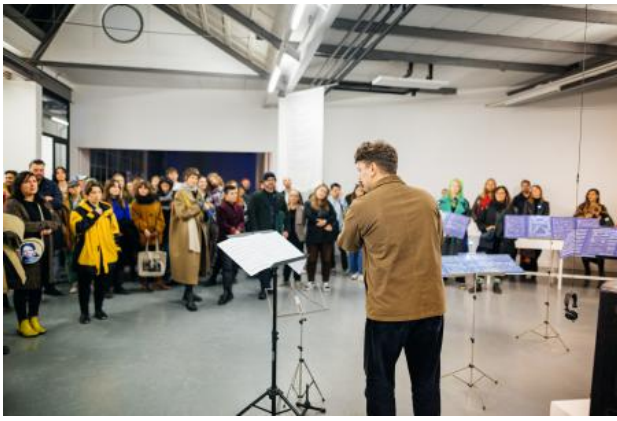
Siren, as part of Scold, Gossip and Siren, 2023