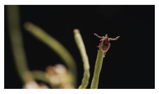
The blind point, 2021 Video