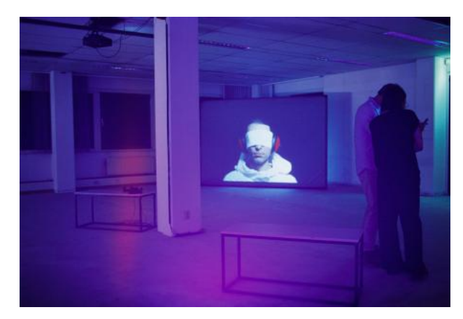
The blind point, 2022