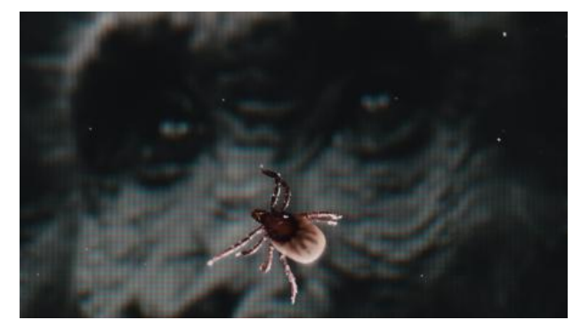
The blind point, 2021 Video