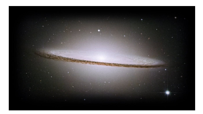
2020, 2021 1:45