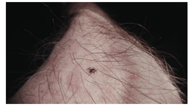
The blind point, 2021 Video