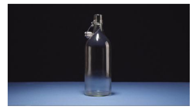
Tests for philosophy on media / The quintessential object, 2021 Video