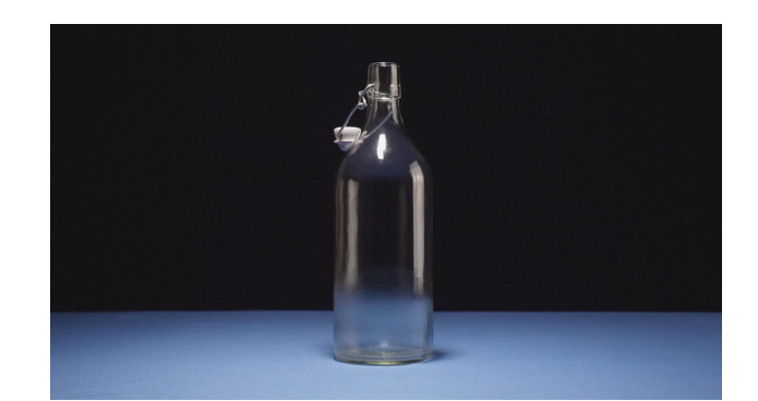
2019, 2021 2:29