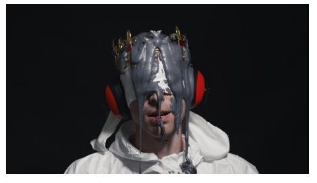
The blind point, 2021 Video