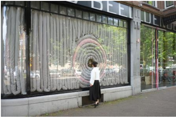
The rest of it is stillness, 2022 textile, patchwork, starch stuffing, 587 x 20 x 131