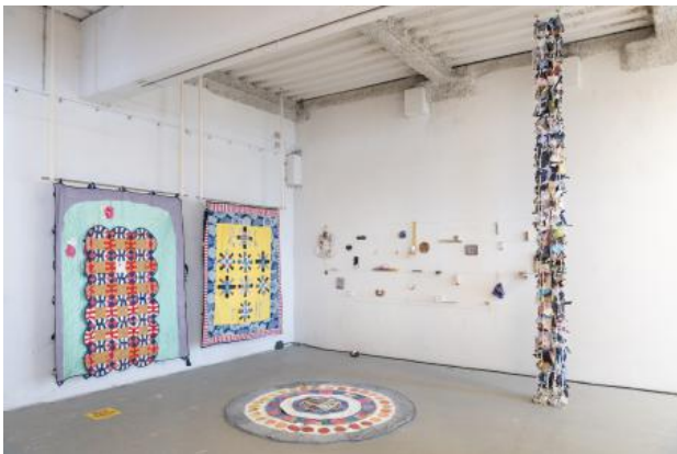
Take my home away, 2022 installation, Textiles, wood, ceramic, paper, 750 x 750