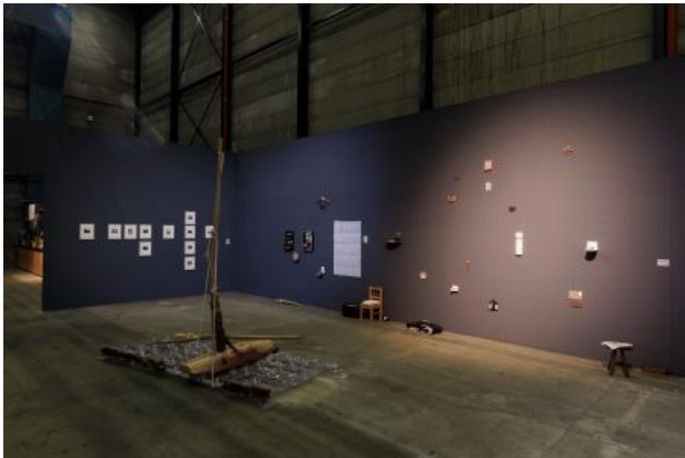
Prospects Art Rotterdam, 2024 installation