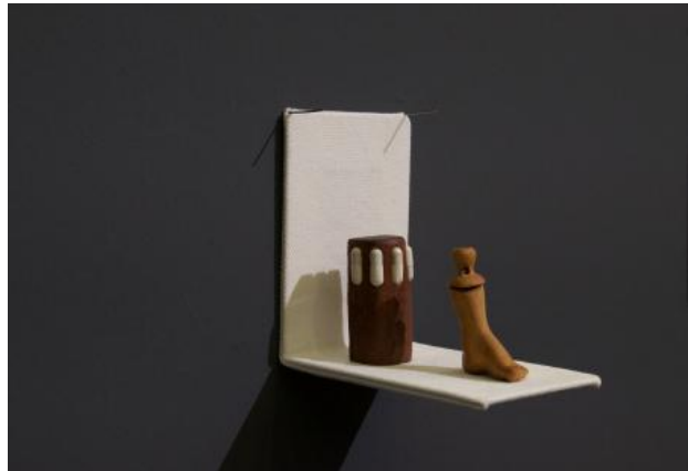
Medication carriers, 2024 wood carving