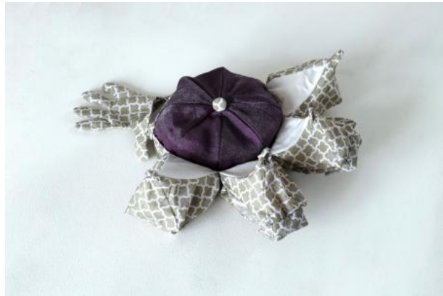
Museum in a hat, 2021 textile, patchwork, synthetic lining, 25 x 25 x 15