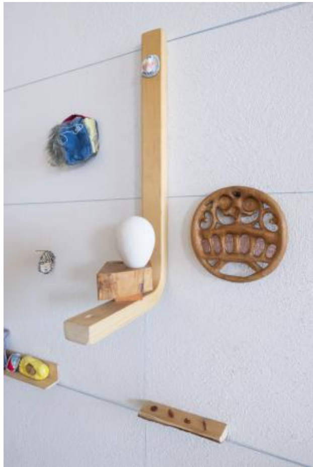
Take my home away, 2022 wood, textiles, ceramics, assorted