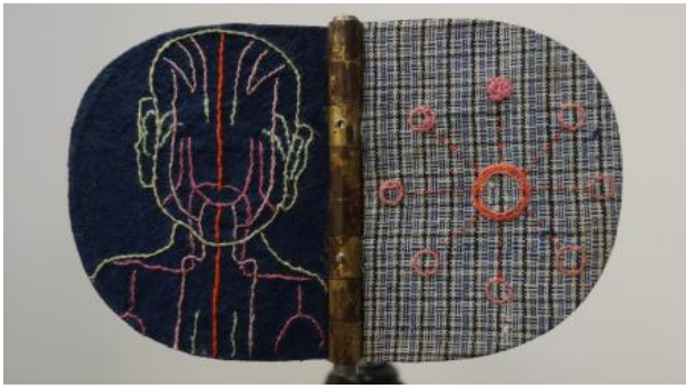
The rest of it is stillness, 2022 embroidery, textile, copper, circuit board and mechanics, 13 x 8 x 35