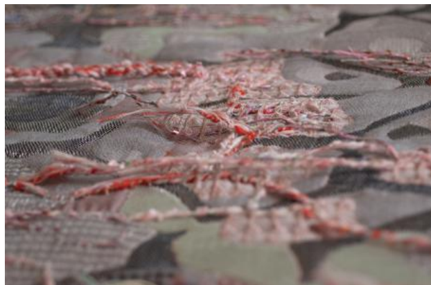
Detail van Builded System, 2021