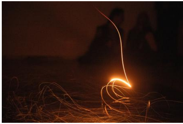
Incandescence - Wire, 2023 Metal wire, Current, 100x200x200