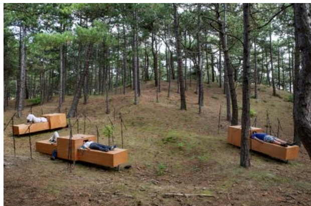
LongStringInstallation, 2023 Wood, Pianostring, Electromagnets, -