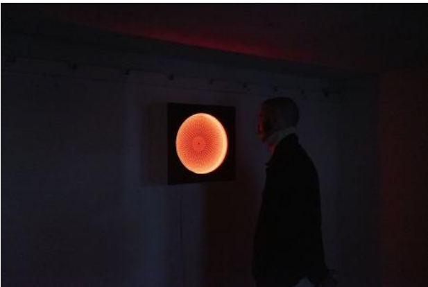
Interference Experiment I Light, Rotating disk, 50x50x40