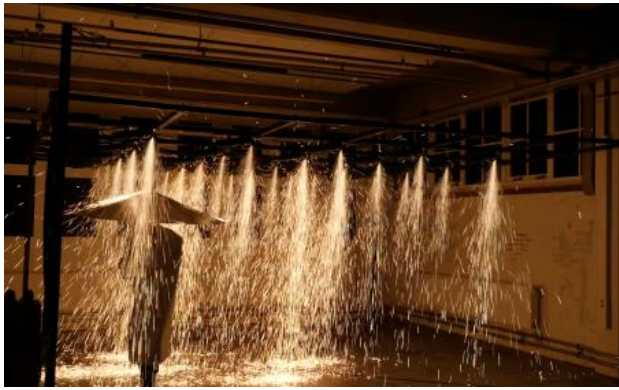
Incandescence - Rain, 2018 Angle grinders, metal, 5m x 5m x 3m