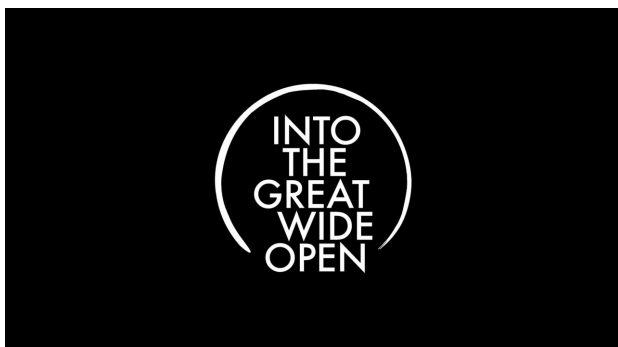
LongStringInstallation, 2023 2:00