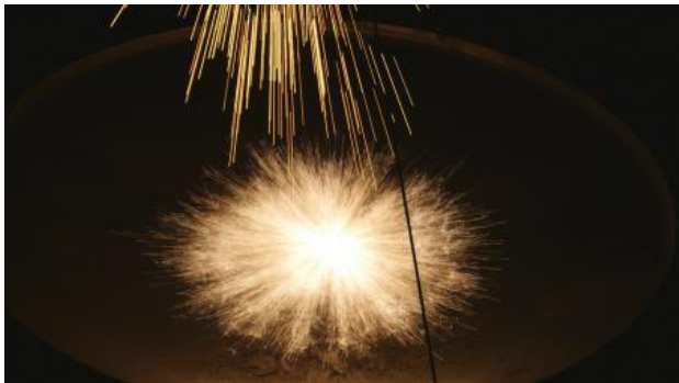
Incandescence - Droplet, 2018 Molten metal, steel, 2m x 2m x 5m