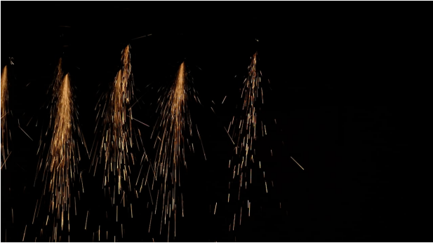
Incandescence - Rain, 2018 1:00