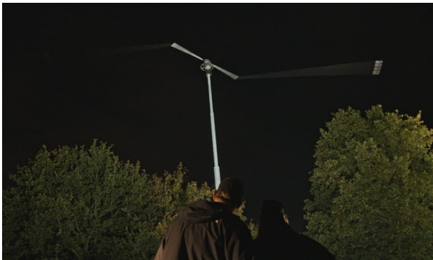
De Zwiepers, 2022 1:41