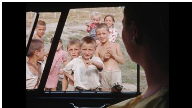
Lake Bottom Cinema, 2023 Film, 25 min.