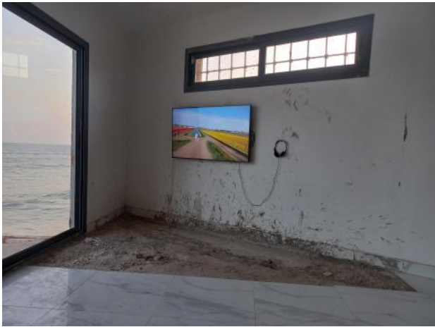
Flowers, 2022 Film, loop, 7 min.