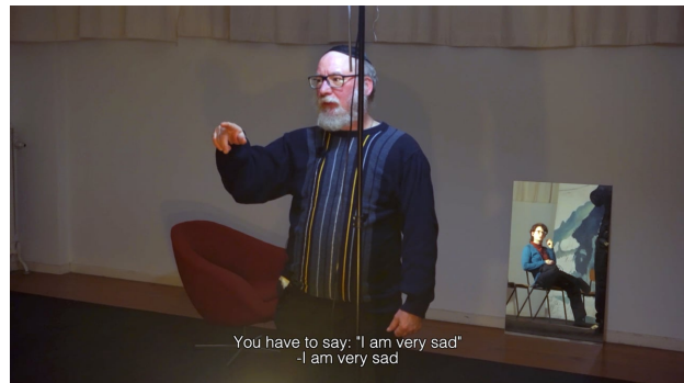
Spiegel (teaser), 2021 01:58