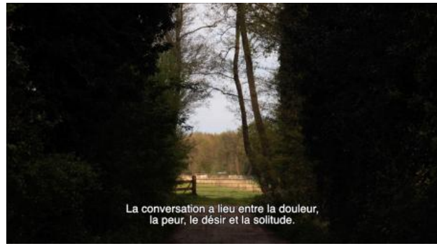
Flowers, 2022 Film, loop, 7 min.