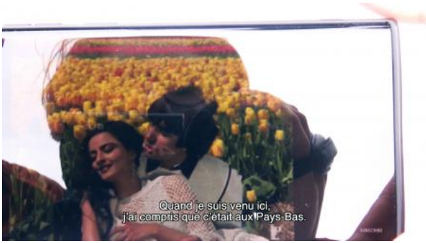
Flowers, 2022 Film, loop, 7 min.