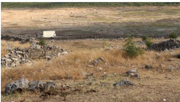
Lake Bottom Cinema, 2023 Film, 25 min.