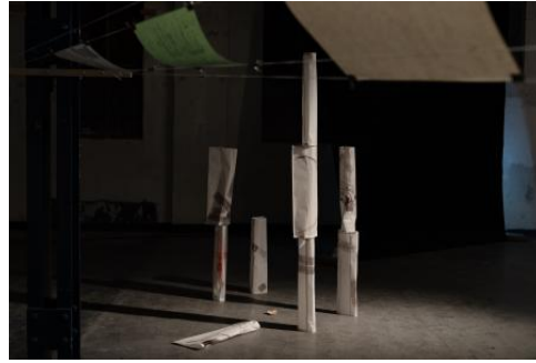
One, none, hundred thousands Drops., 2024 papers sewed together, typewritten, ink stamps, 1x1x3m