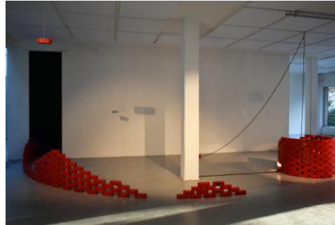
As Common as Well, 2023 rubber bricks, rope, hooks, sewed paper