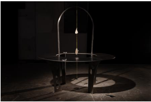
One, none, hundred thousands Drops., 2024 Aluminium laser-cutting and welding, 170x170x170cm