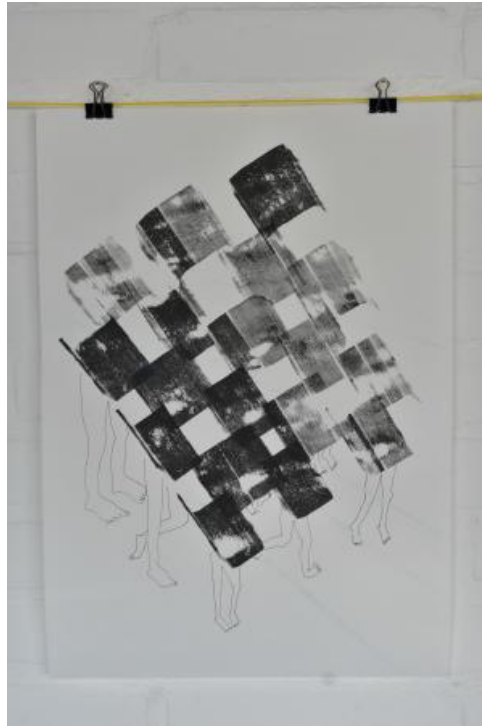
The Roof we made, 2024 drawing, typewriter, ink, chalkline, A3