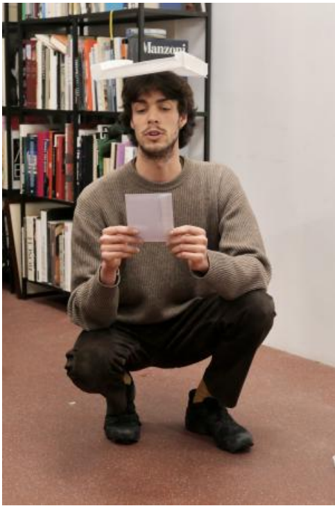
The Roof we made, 2024 sewed papers, typewriting, 40x30x3