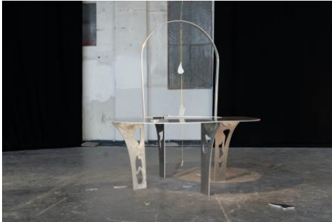
One, none, hundred thousands Drops., 2024 Aluminium laser-cutting and welding, 170x170x170cm