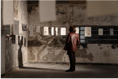
One, none, hundred thousands Drops., 2024 typewritten, drawing, ink, mix, A4, A3