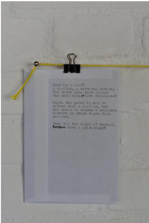
The Roof we made, 2024 typewriter on letter envelope, A5