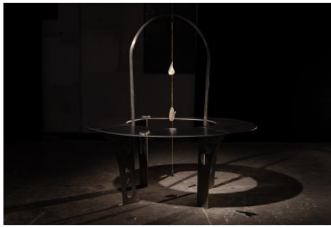
One, none, hundred thousands Drops., 2024 Aluminium laser-cutting and welding, 170x170x170cm