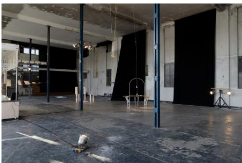
One, none, hundred thousands Drops., 2024