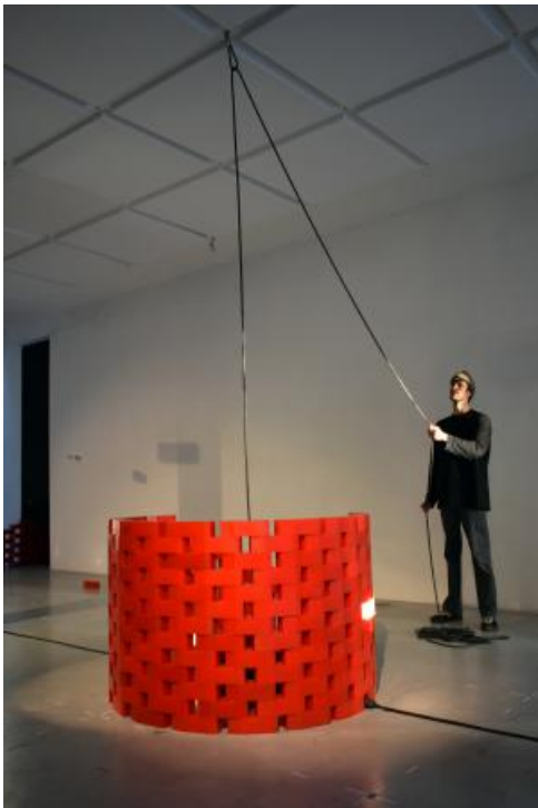
As Common as Well, 2023 ruber bricks, rope, hook