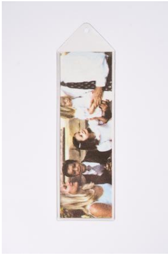
Where is my confirmation?, 2021 RISO printed -- archive material