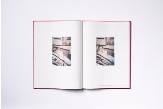
Nuking the Nuclear Family, 2021 Academic and Personal Writing