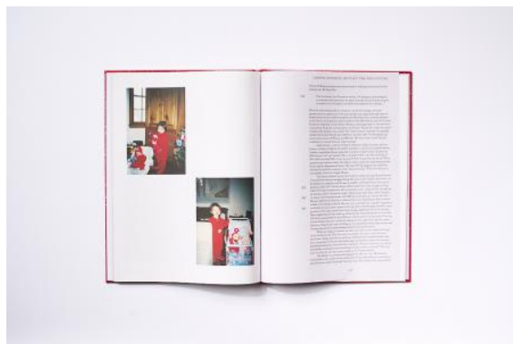
Nuking the Nuclear Family, 2021 Academic and Personal Writing