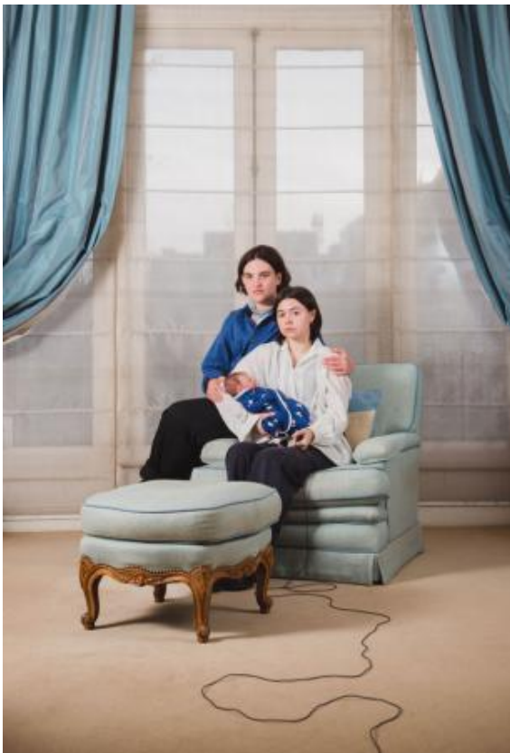
We at least deserve softness, 2022

-- LVMK Gallery The Hague, Netherlands https://www.lvmk.eu/