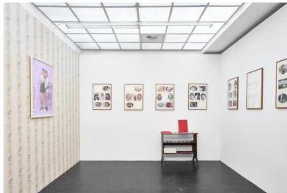
Grammy's Praying For Me- Installation at Grad Show, 2021 Archived images, custom made passpartout, framed