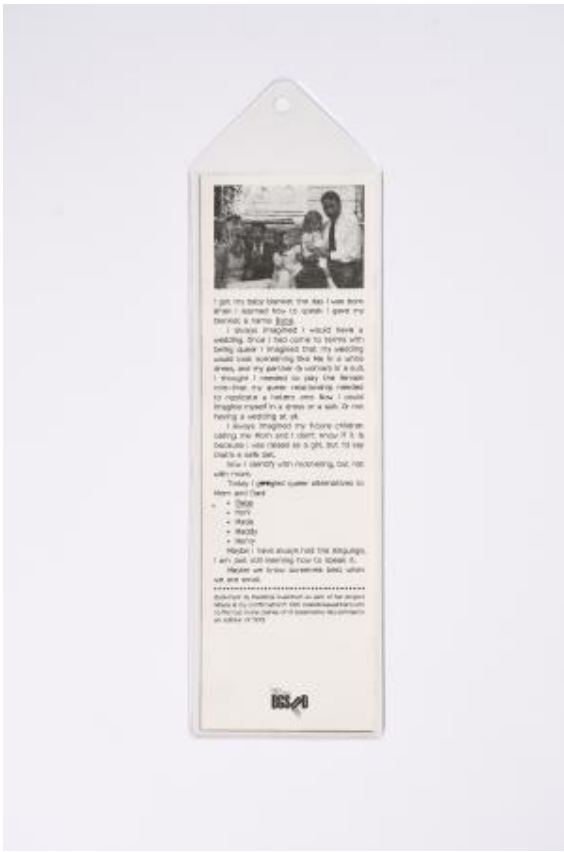
Where is my confirmation?, 2021 RISO printed -- archive material