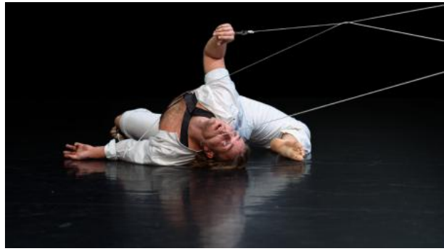
'tens:ding [bending over backwards]', 2022