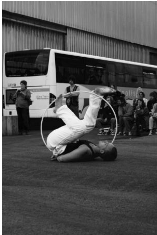
'O' - Kollektief O, 2023