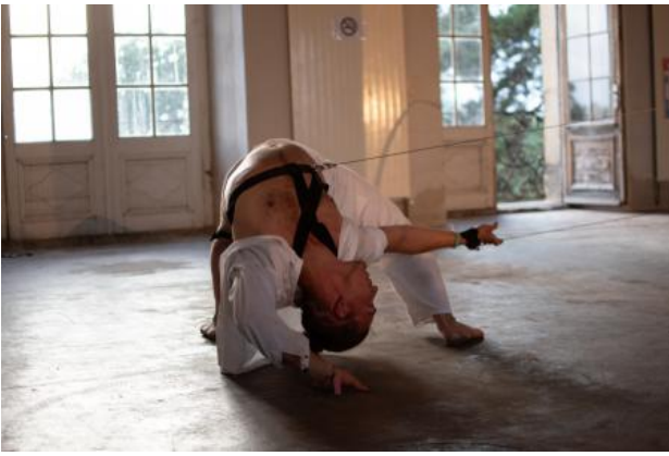
'tens:ding [bending over backwards]', 2023