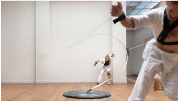
'tens:ding [bending over backwards]', 2022