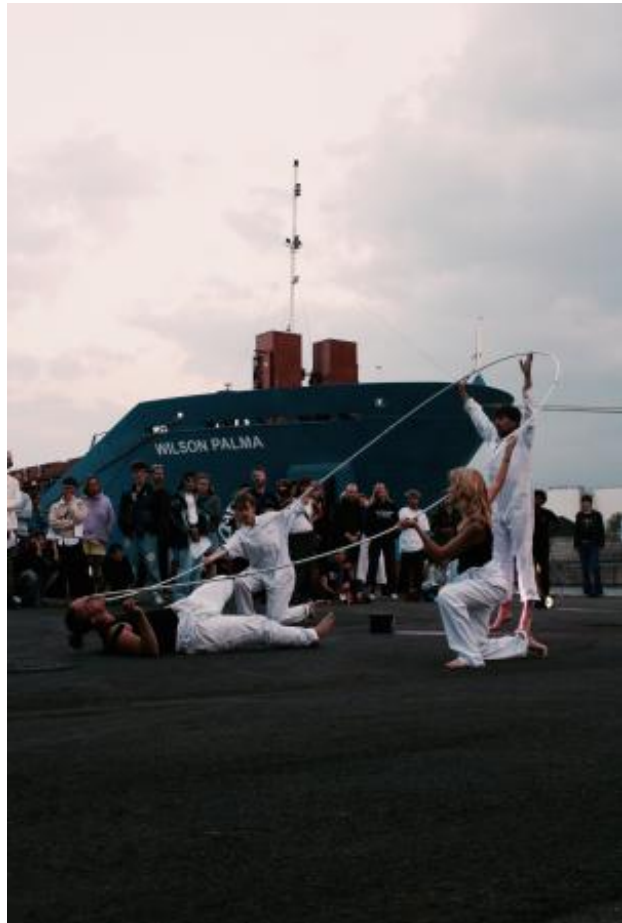
'O' - Kollektief O, 2023