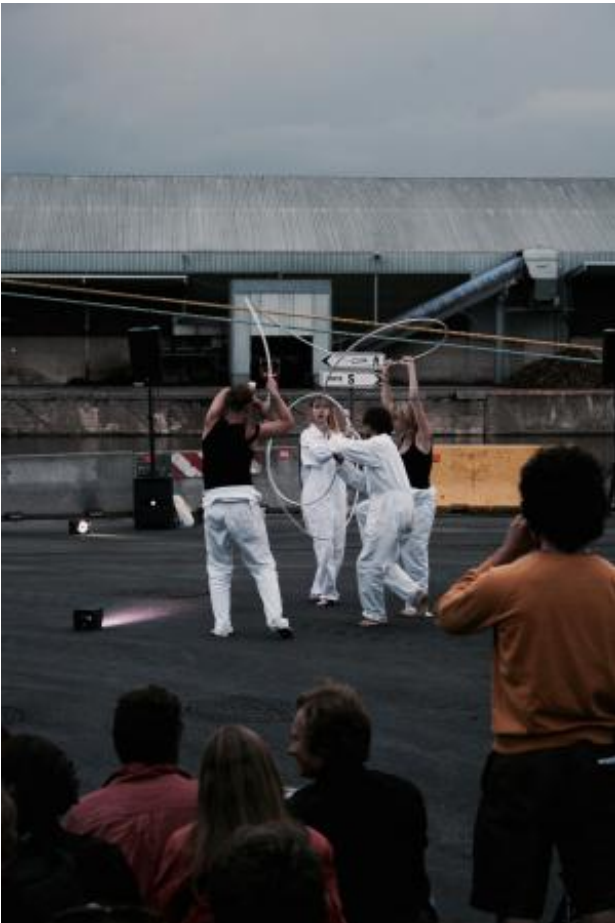
'O' - Kollektief O, 2023