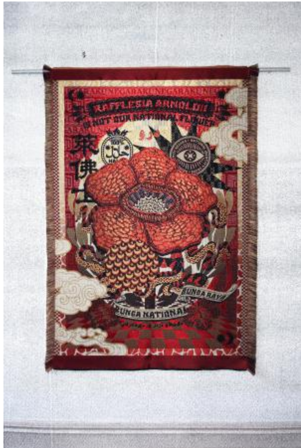
Woven Postcard: Rafflesia is not our National Flower, 2024 Industrial Jacquard Weaving , 75 x 110 cm