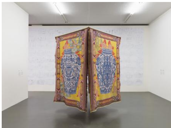
Expecting, 2023 Industrial Jacquard Weaving , 170 x 170 x 235