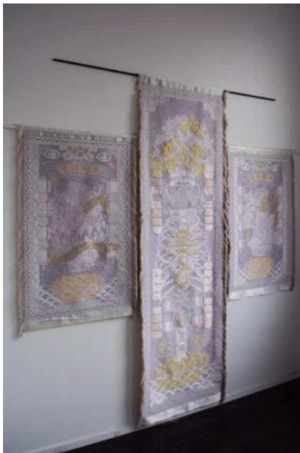
HUNGER, 2023 Industrial Jacquard Weaving , 240 x 225 cm