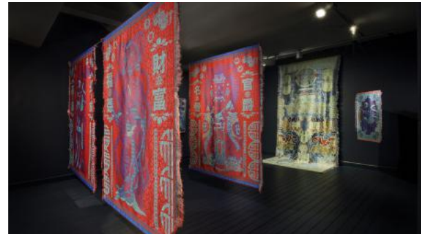
Three Contemporary Prosperities, 2023 Industrial Jacquard Weaving , Installation