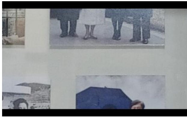
Alexa, they are the women I grew up with, 2022 Three-channel video, 27'29"