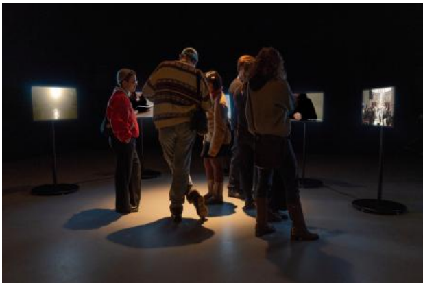
49 Days, 2024 Video installation , Five-channel video, loop, 2024