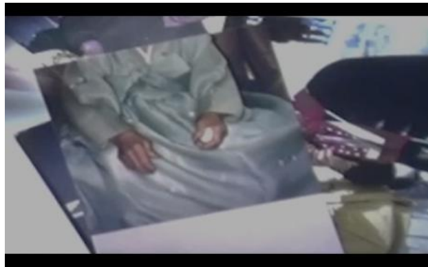
Alexa, they are the women I grew up with, 2022 video, 27'29"