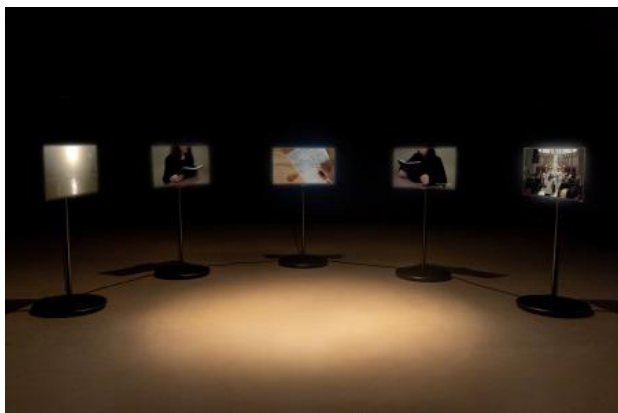
49 Days, 2024 Video installation , Five-channel video, loop, 2024