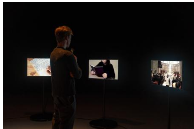
49 Days, 2024 Video installation , Five-channel video, loop, 2024