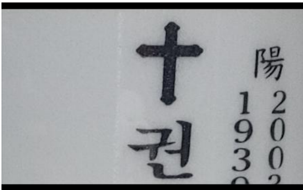
Alexa, they are the women I grew up with, 2022 video, 27'29"