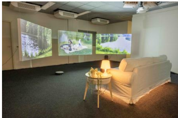
Alexa, they are the women I grew up with, 2022 Video installation, dimensions variable