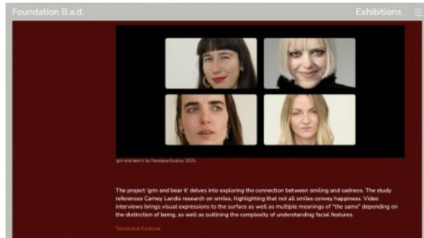
Grin and bear it, 2025 Short film