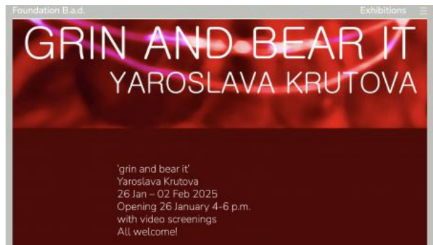
Grin and bear it, 2025 Mixed media