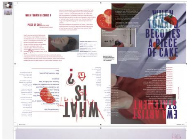
When Tomato Becomes a Piece of Cake, 2023