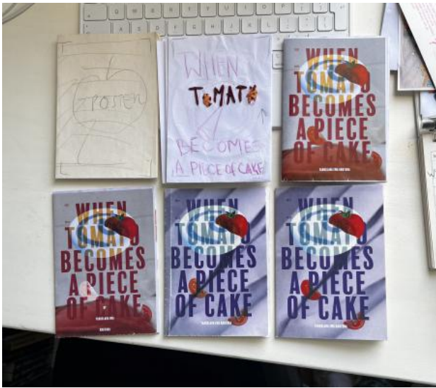
When Tomato Becomes a Piece of Cake, 2023 Publication