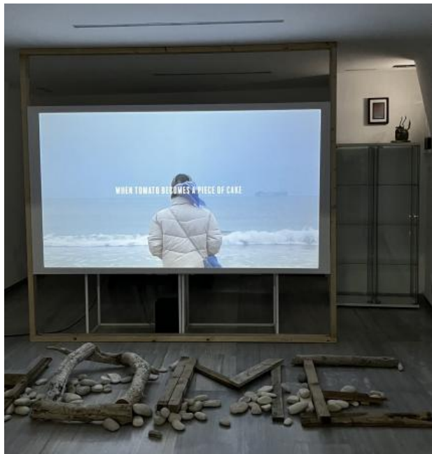
When Tomato Becomes a Piece of Cake, 2023 Short film