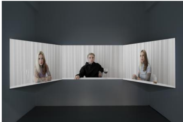
I Don't Think I'll Stay Here Long 2023, 2023 Three-channel installation