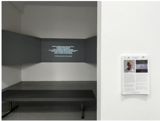
I Don't Think I'll Stay Here Long 2023, 2023 Three-channel installation