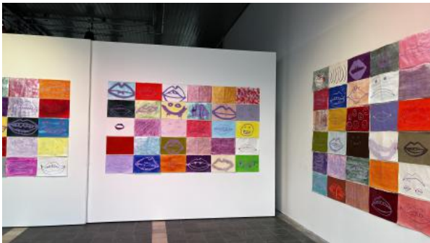
Grin and bear it, 2025 Acril, Watercolour, Soft pastel, Ink, Marker, 29,7cm * 42cm