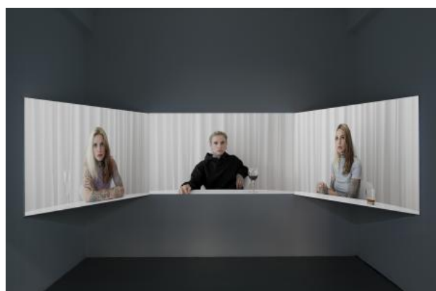
I Don't Think I'll Stay Here Long 2023, 2023 Three-channel installation