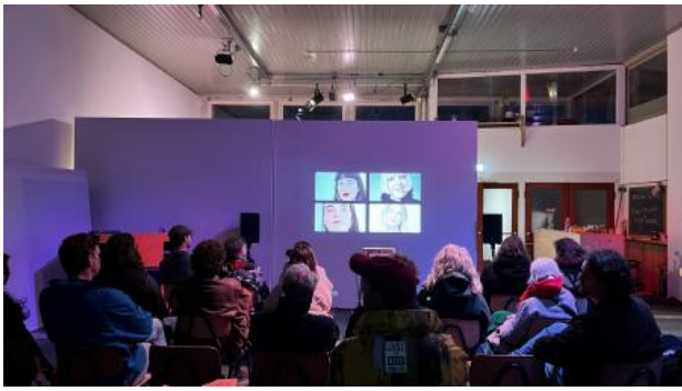
Grin and bear it, 2025 Short film