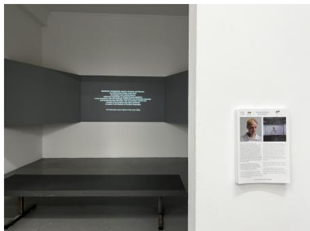
I Don't Think I'll Stay Here Long 2023, 2023 Three-channel installation