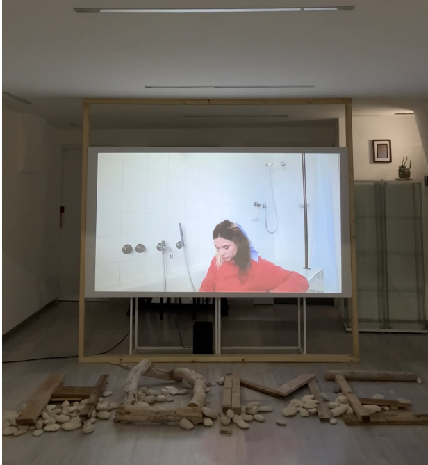
When tomato becomes a piece of cake, 2023