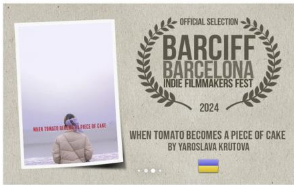
When tomato becomes a piece of cake, 2024 Short film