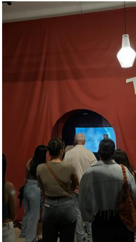
When Tomato Becomes a Piece of Cake, 2023 Screening