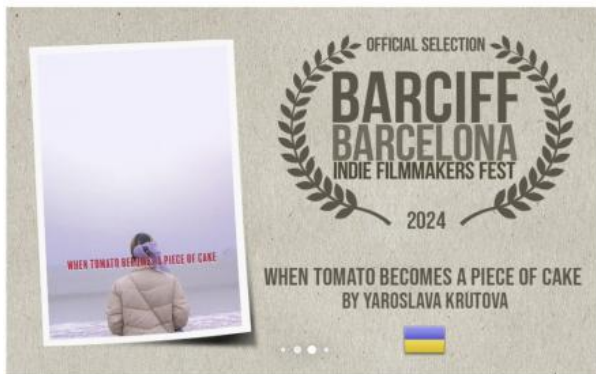
When tomato becomes a piece of cake, 2024 Short film

2022 Support Fund for Ukrainian artists Nederlands Letterenfonds The Hague, Netherlands THE SUPPORT FUND IS ADMINISTERED BY THE DUTCH FOUNDATION FOR LITERATURE, IN COLLABORATION WITH THE OTHER DUTCH NATIONAL CULTURAL FOUNDATIONS (THE CREATIVE INDUSTRIES FUND NL, THE MONDRIAAN FUND, THE NETHERLANDS FILM FUND, THE PERFORMING ART FUND NL AND THE CULTURAL PARTICIPATION FUND).