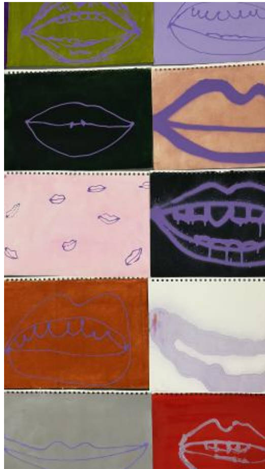
Grin and bear it, 2025