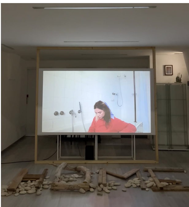
When tomato becomes a piece of cake, 2023