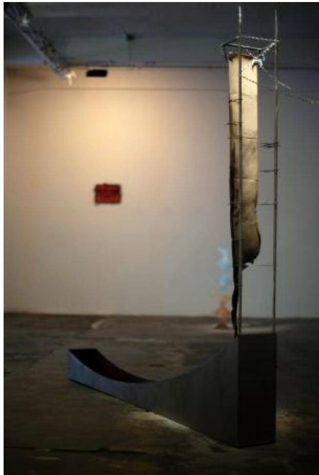
RECIPROCAL PERMEATION, 2023 Dying, Hand stitching, Rust printing, Laser cutting and Welding, 190x 18 x180