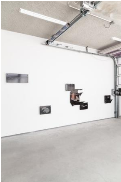
Ferocious Molten Metal Has The Potential To Prevail, 2023 laser-cut and powder-coated steel