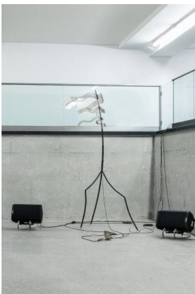
Alagya - Landmark, 2022 metal, laser-cut and thermoformed acrylic, sound