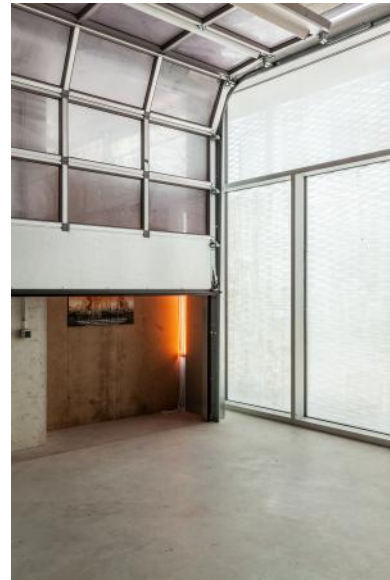
Machine-Gun-Fire Like Crying, 2023 inkjet print, wood, lights, garage door