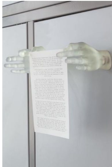
Metallurgia, 2023 transparent resin print, paper