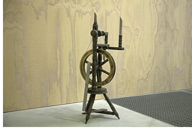
Rokka with Metallic-Hard-Ware-Prósthetics., 2022 spinning wheel, metal, stainless steel wire