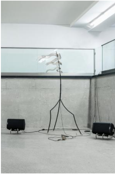
Alagya - Landmark, 2022 metal, laser-cut and thermoformed acrylic, sound