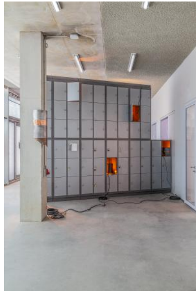
Metallurgia - United, Metallic, Nomadic, 2023 lockers, metal, transparent resin print, lights