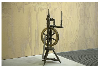
Rokka with Metallic-Hard-Ware-Prósthets., 2022 spinning wheel, metal, stainless steel wire