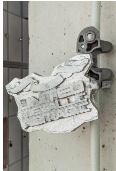
United, Metallic, Nomadic, 2023 cast aluminium, motorcycle dashboard holder