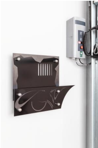
Ferocious Molten Metal Has The Potential To Prevail, 2023 laser-cut and powder-coated steel