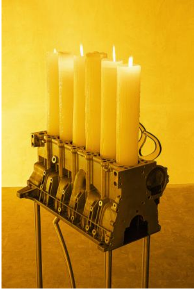
Alagya - Bambi, 2021 metal, engine block, laser-cut and thermoformed acrylic, candles, fire