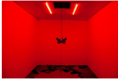
Alagya - Maps of The Untamed Threshold, 2022 laser-cut acrylic, animation on screen, leather, lights