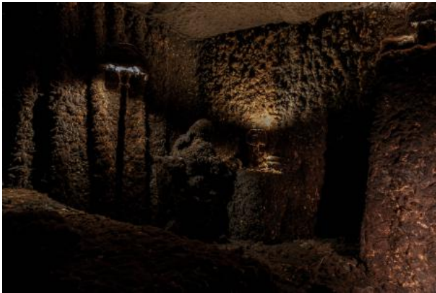
Between Whispering Walls, 2020