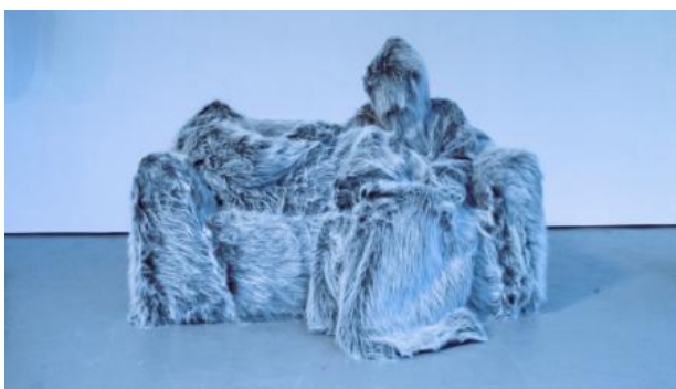
Dreaming in Blue, 2023