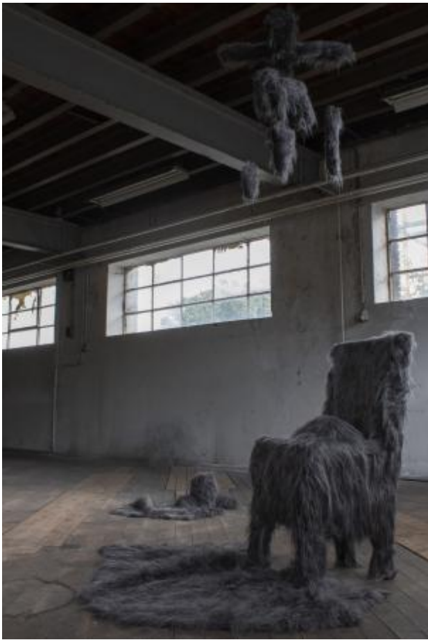
Tears of Memory, 2021