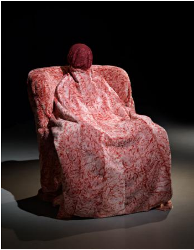
The Giant, 2022