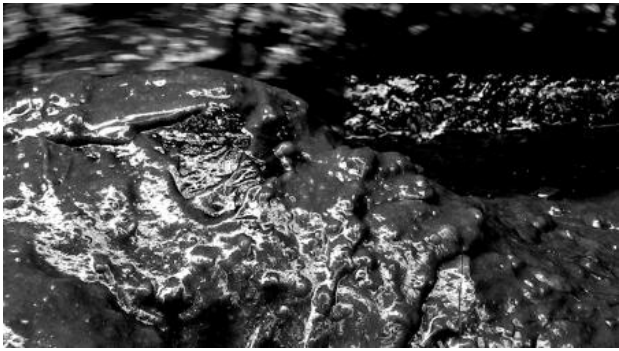
Mother and Sister, 2022