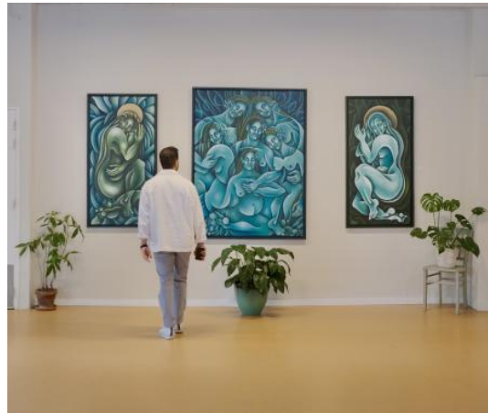
Exhibition 'Root to Rise' in Amsterdam, 2024