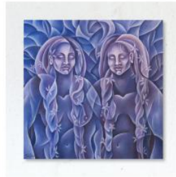
'Skin - scars from resilient women' Acrylic on canvas 90x90cm (square). Available for sale.