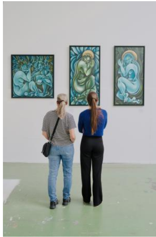
Visitors view three paintings " 'The Bath', 'Meandering River' and 'Sleeping River', 2024 Acrylic on canvas, 100x100x4cm / 140x70x4cm / 140x70x4cm