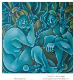
Two works: 'Water Springs' and 'The Bath', 2024 Acrylic on canvas, 160x120x4cm // 140x70x4cm / 140x70x4cm

Ongoing project: The "Mother Trees" series explores the concept of mother trees and their impact on human perception of the natural world and our ability to connect with it.