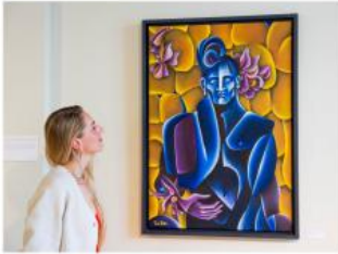
The recent exhibition 'Root to Rise' at the Westergaard in Amsterdam, from 9-28 June 2024. This gallery show celebrated the quality of masculinity and femininity, as we celebrated the vibrant time of European Summer Solstice (or "Midsummer") at the end of the month.